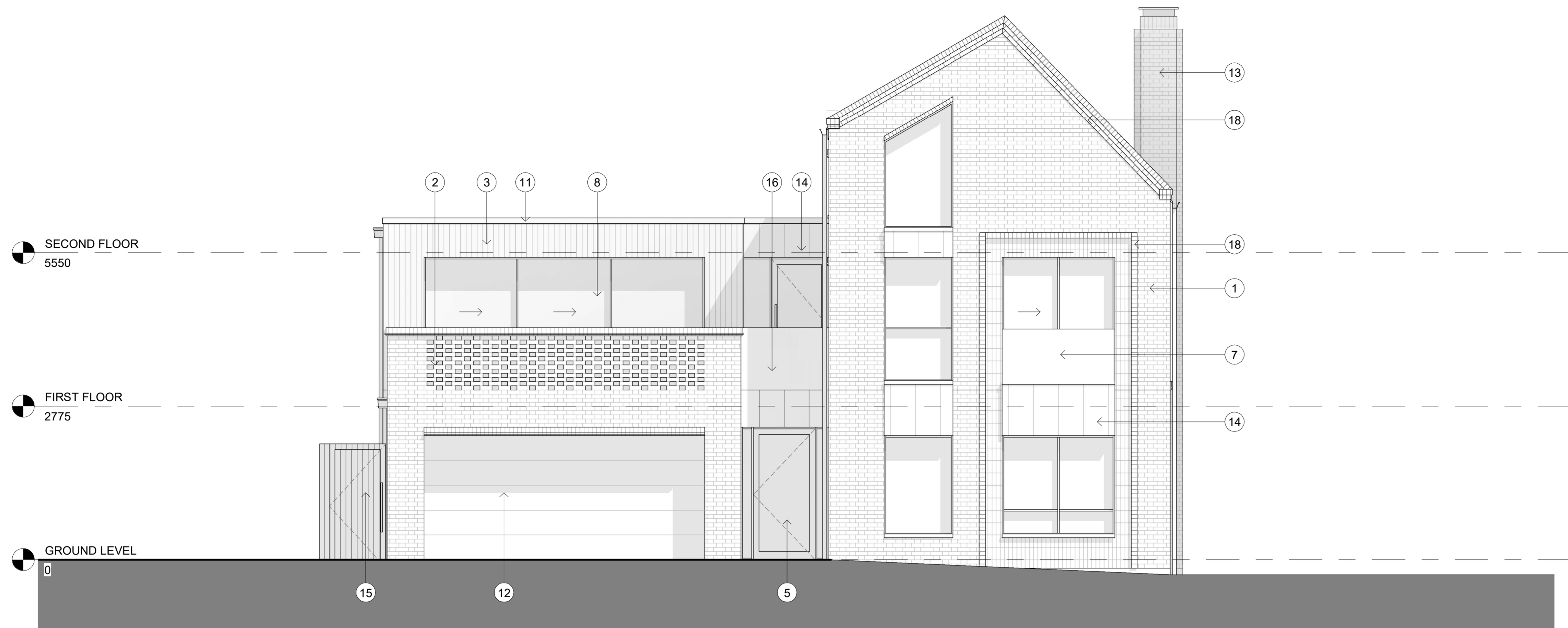
Elevation 01 1 : 50