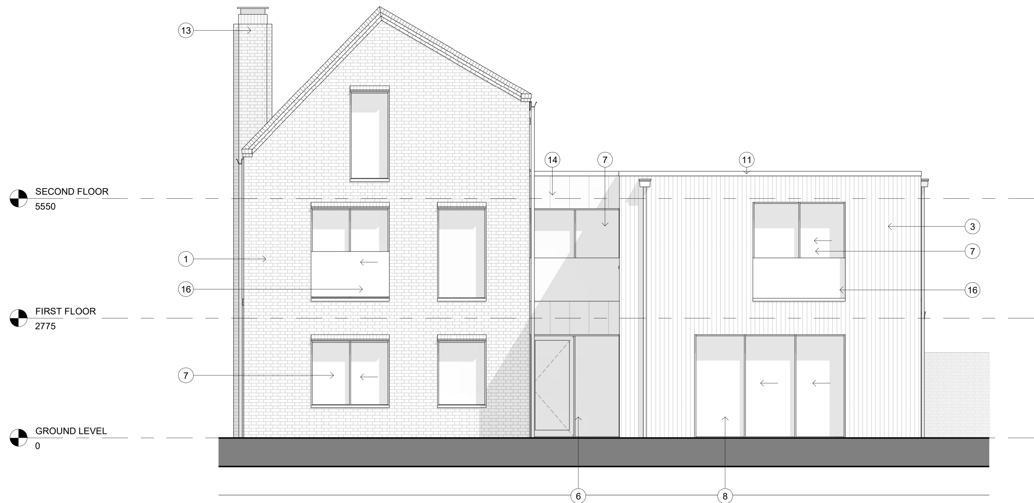
Elevation 03 1 : 50