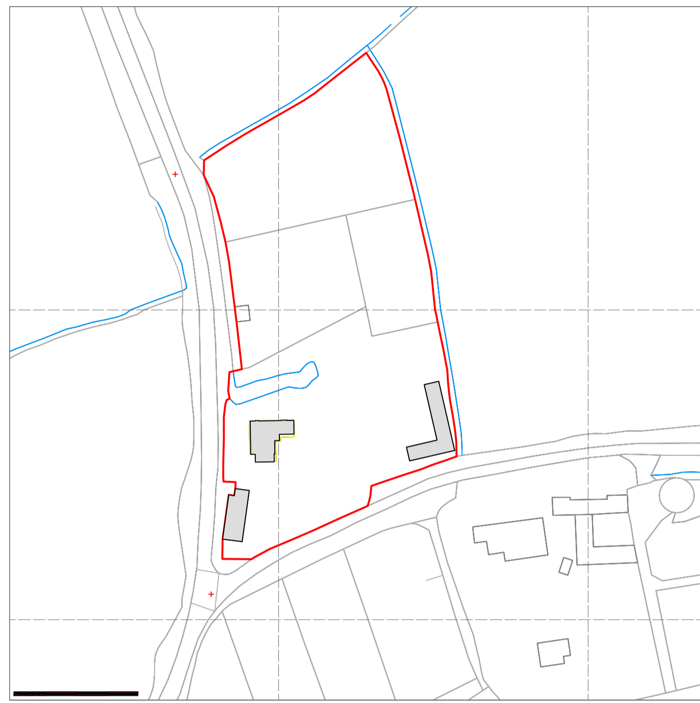
1 Site Location Plan Scale: 1:1250