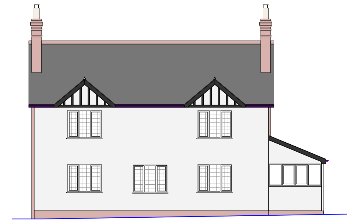
7 Existing West Elevation Scale: 1:100