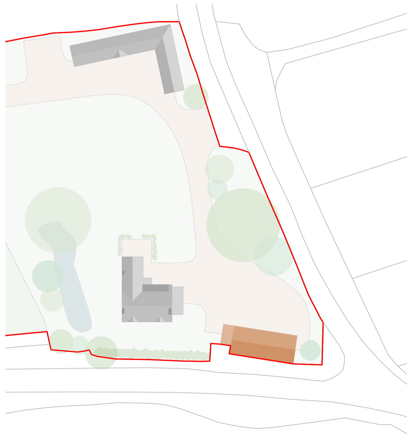
2 Existing Block Plan Scale: 1:500