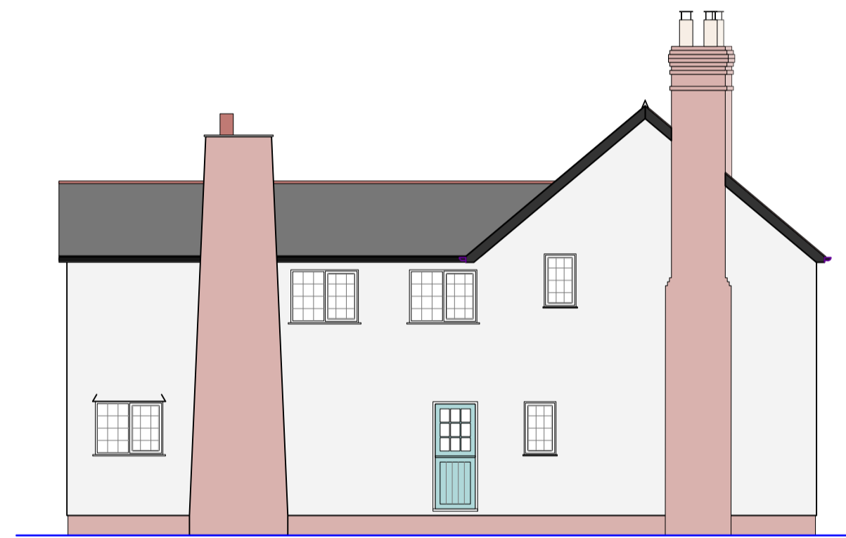
5 Existing North Elevation Scale: 1:100