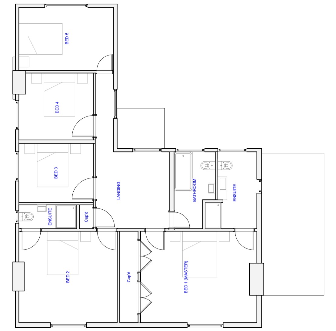
4 Existing First Floor Plan Scale: 1:100