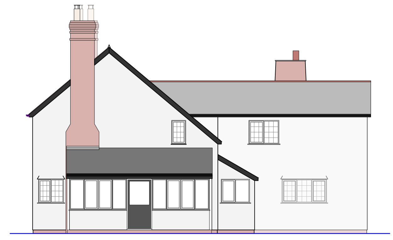
8 Existing South Elevation Scale: 1:100