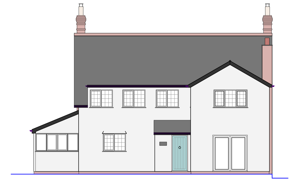
6 Existing East Elevation Scale: 1:100