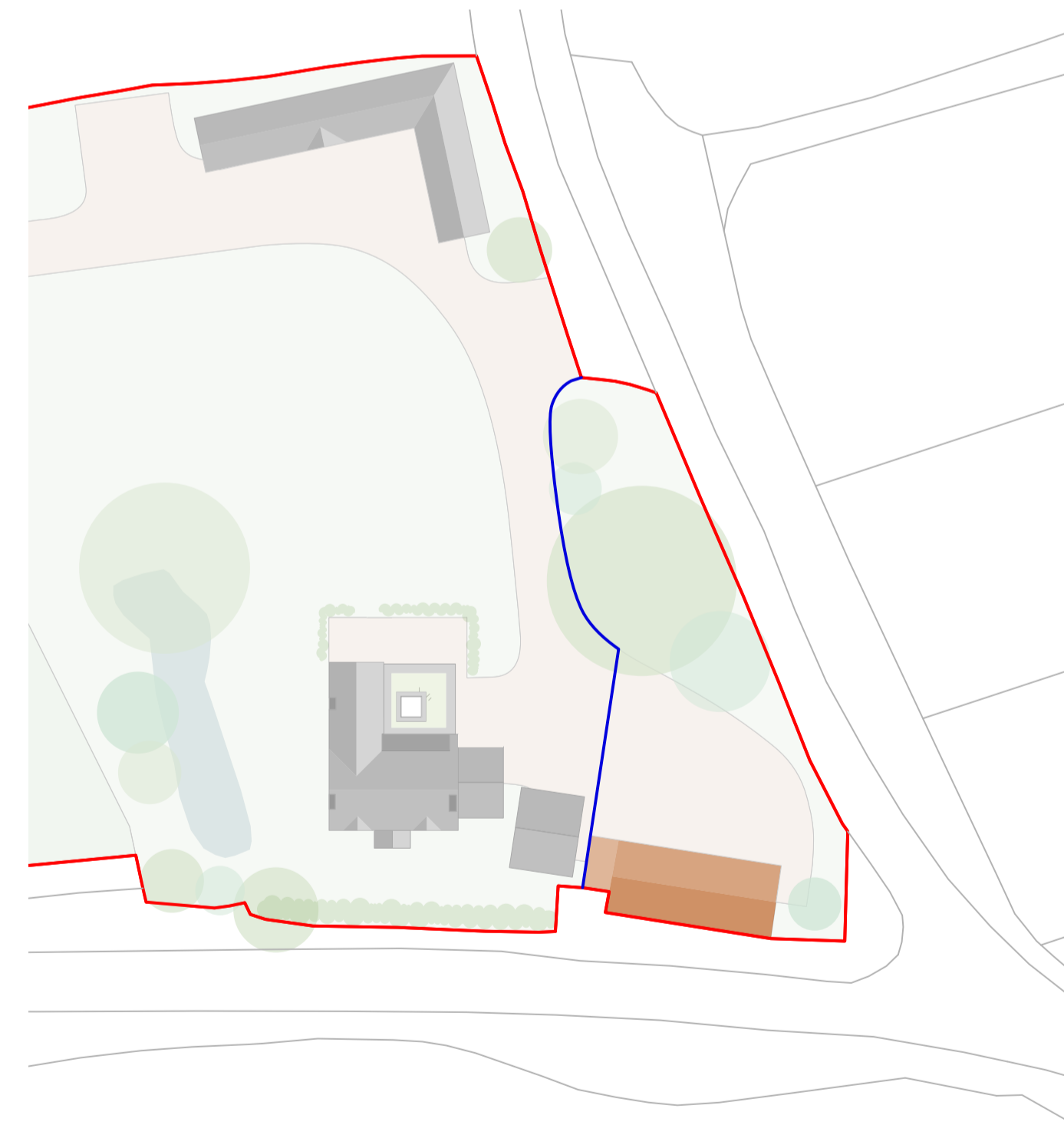
1 Proposed Block Plan Scale: 1:500 A north arrow pointing to the right and a scale bar marked from 0 to 50 meters in increments of 10 meters.