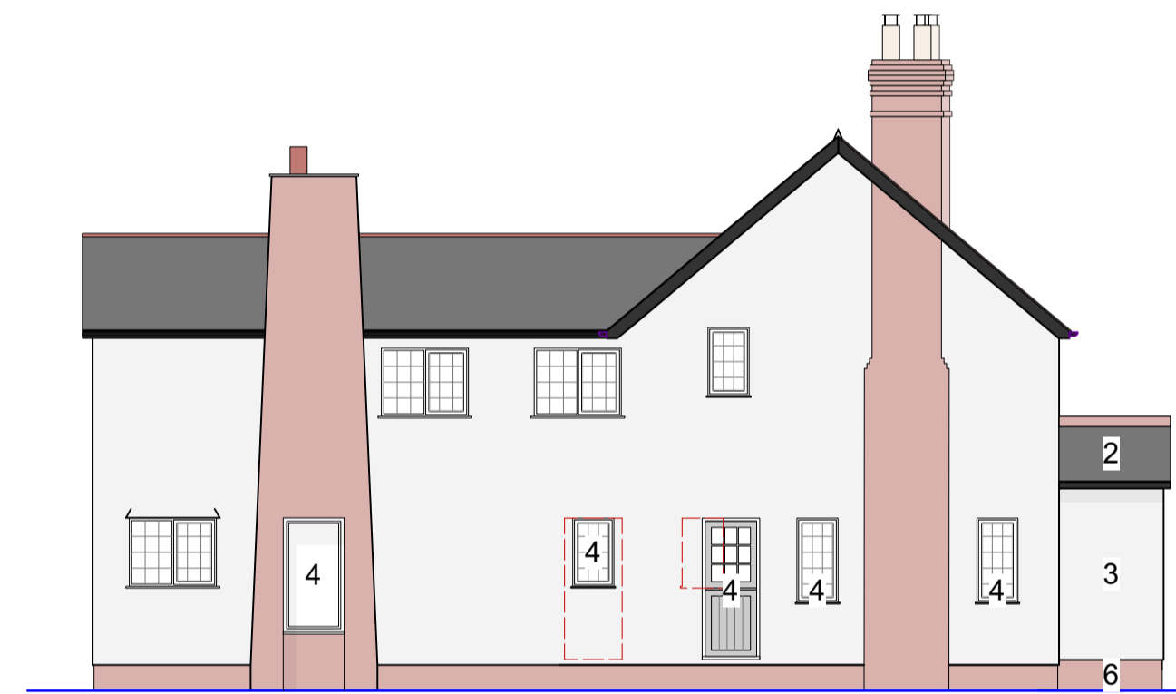
4 Proposed North Elevation Scale: 1:100