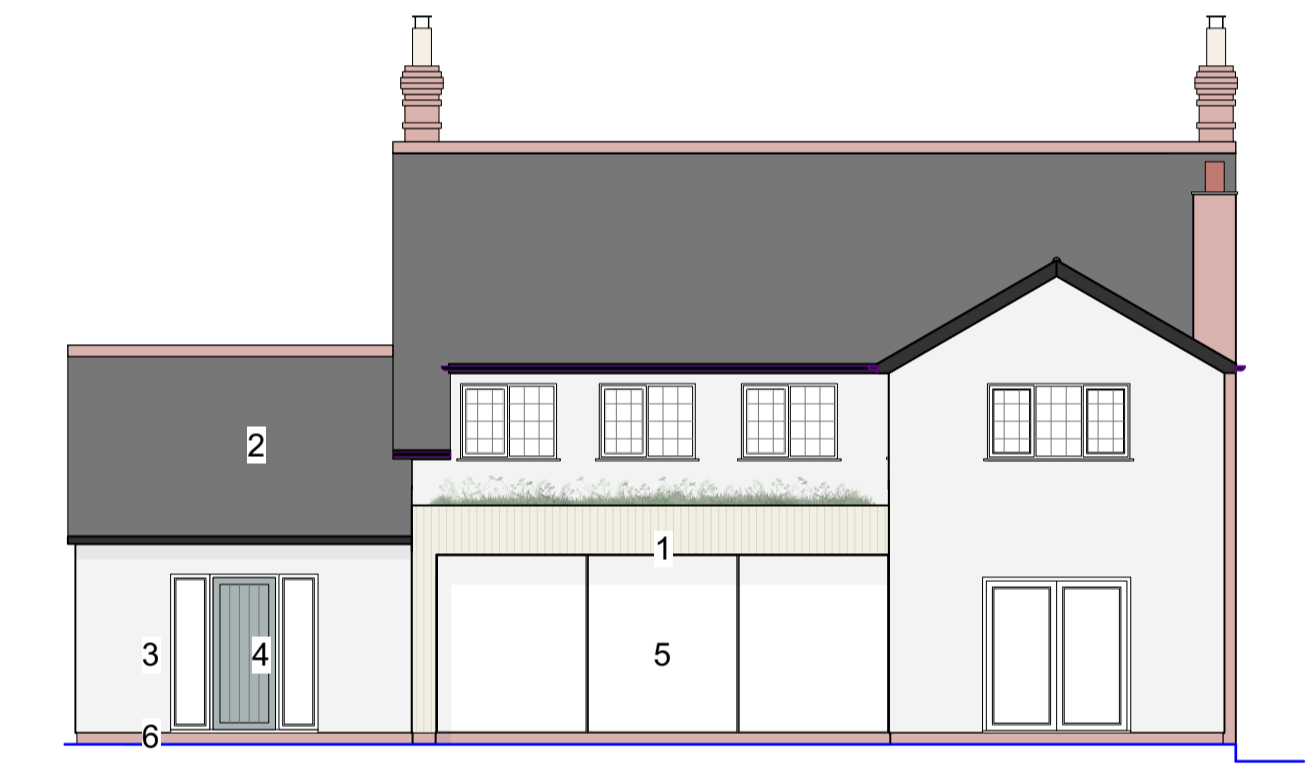
5 Proposed East Elevation Scale: 1:100