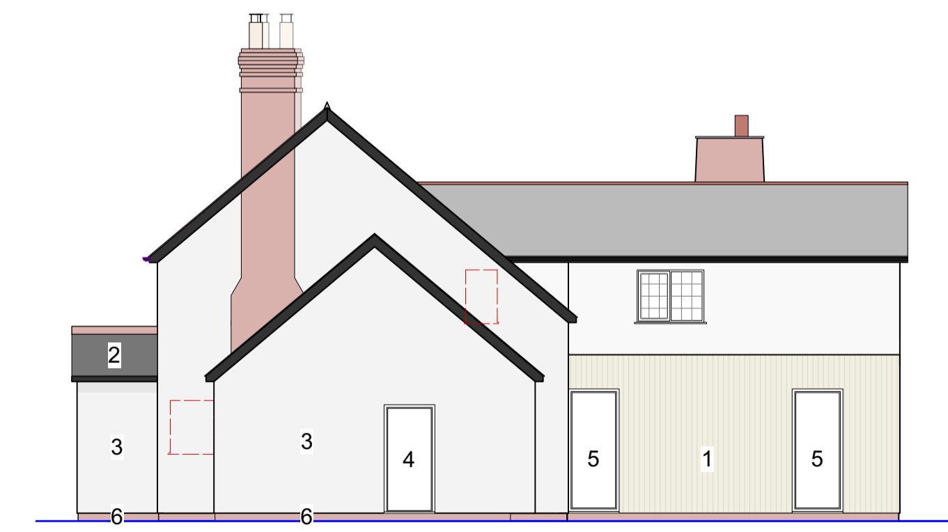
7 Proposed South Elevation Scale: 1:100