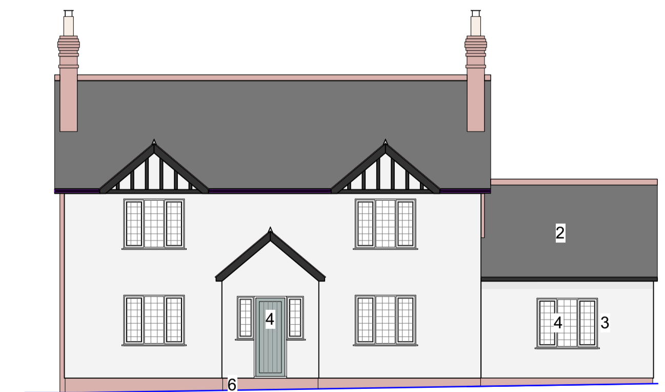
6 Proposed West Elevation Scale: 1:100