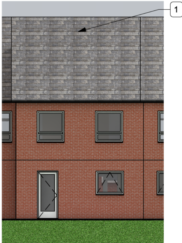
2 North Elevation - Existing Scale: 1:100