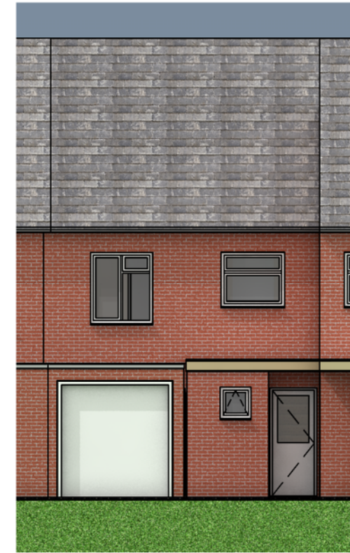
4 South Elevation - Existing Scale: 1:100