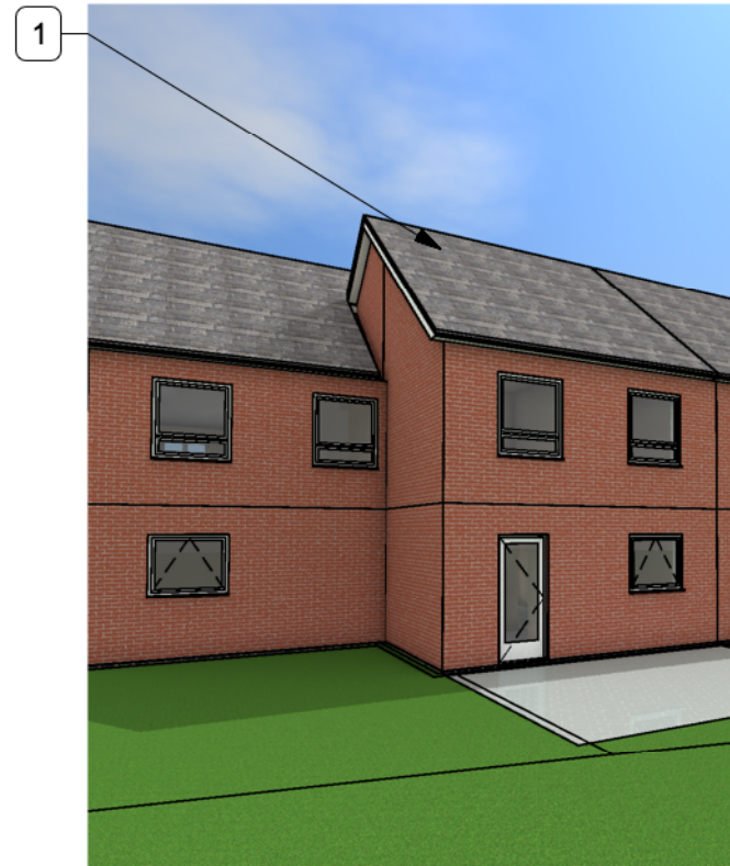
3 North Perspective - Existing Scale: Not to scale