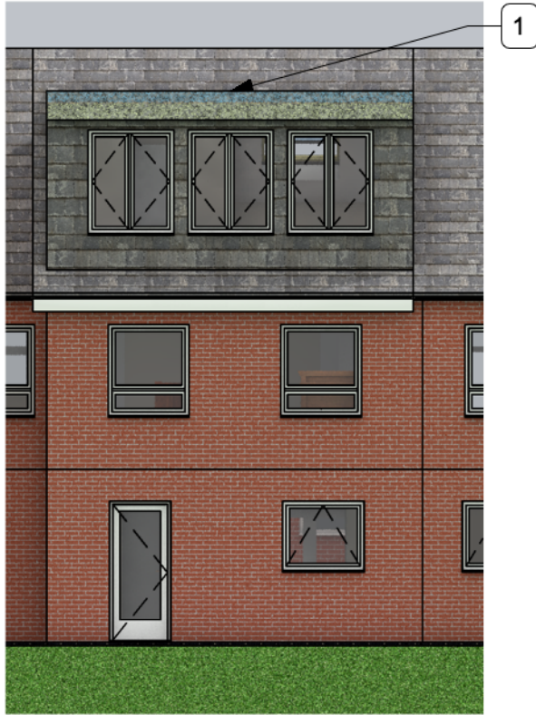
2 North Elevation - Proposed Scale: 1:100

2. New velux windows to be installed in pitched roof.