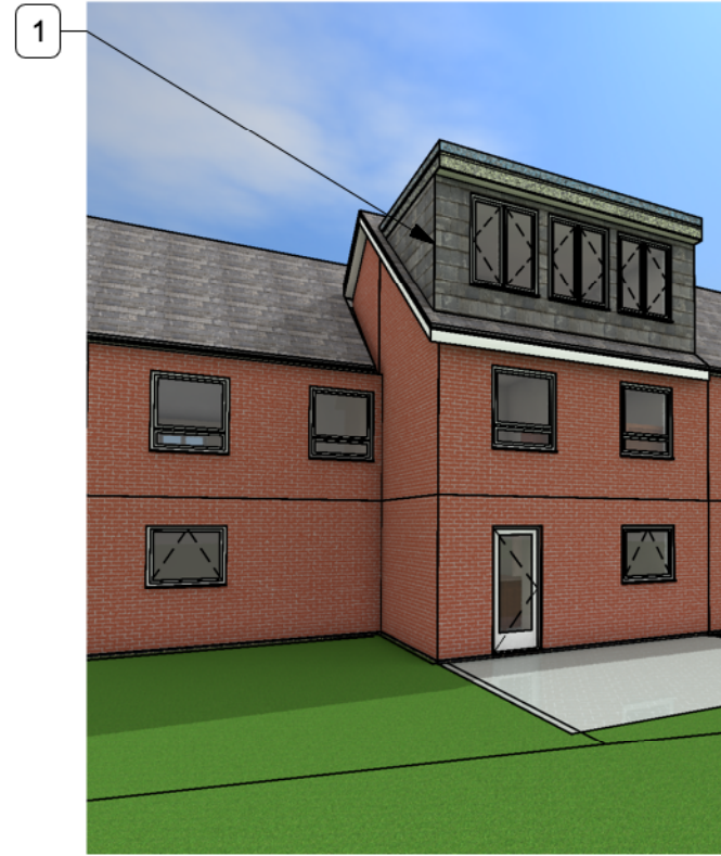
3 North Perspective - Proposed Scale: Not to scale