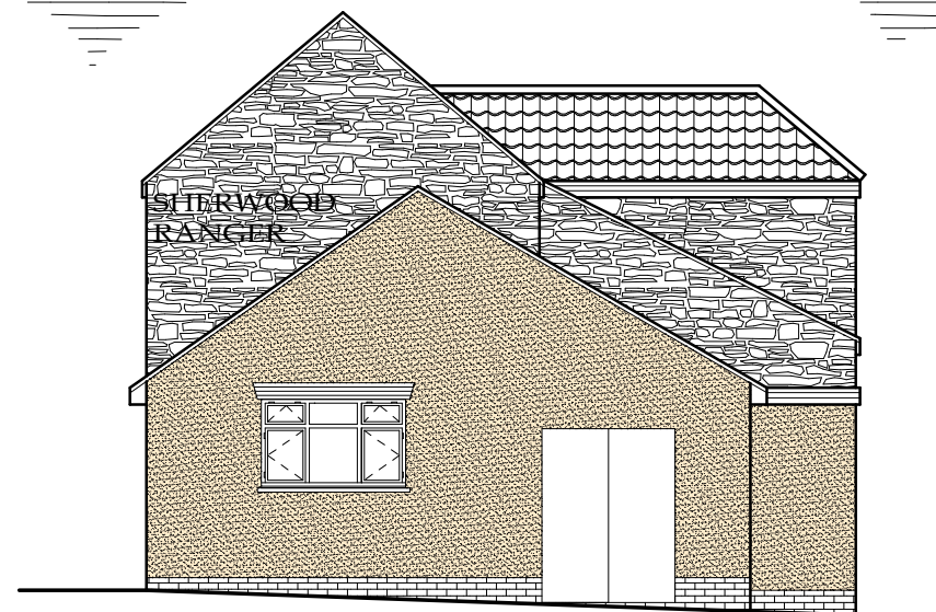
Side Elevation to Car Park as Existing.