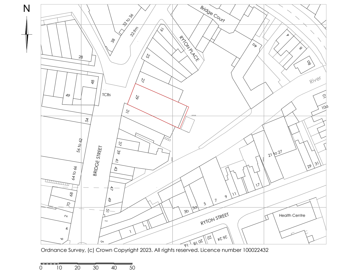
Existing Lease Plan Scale 1:1000