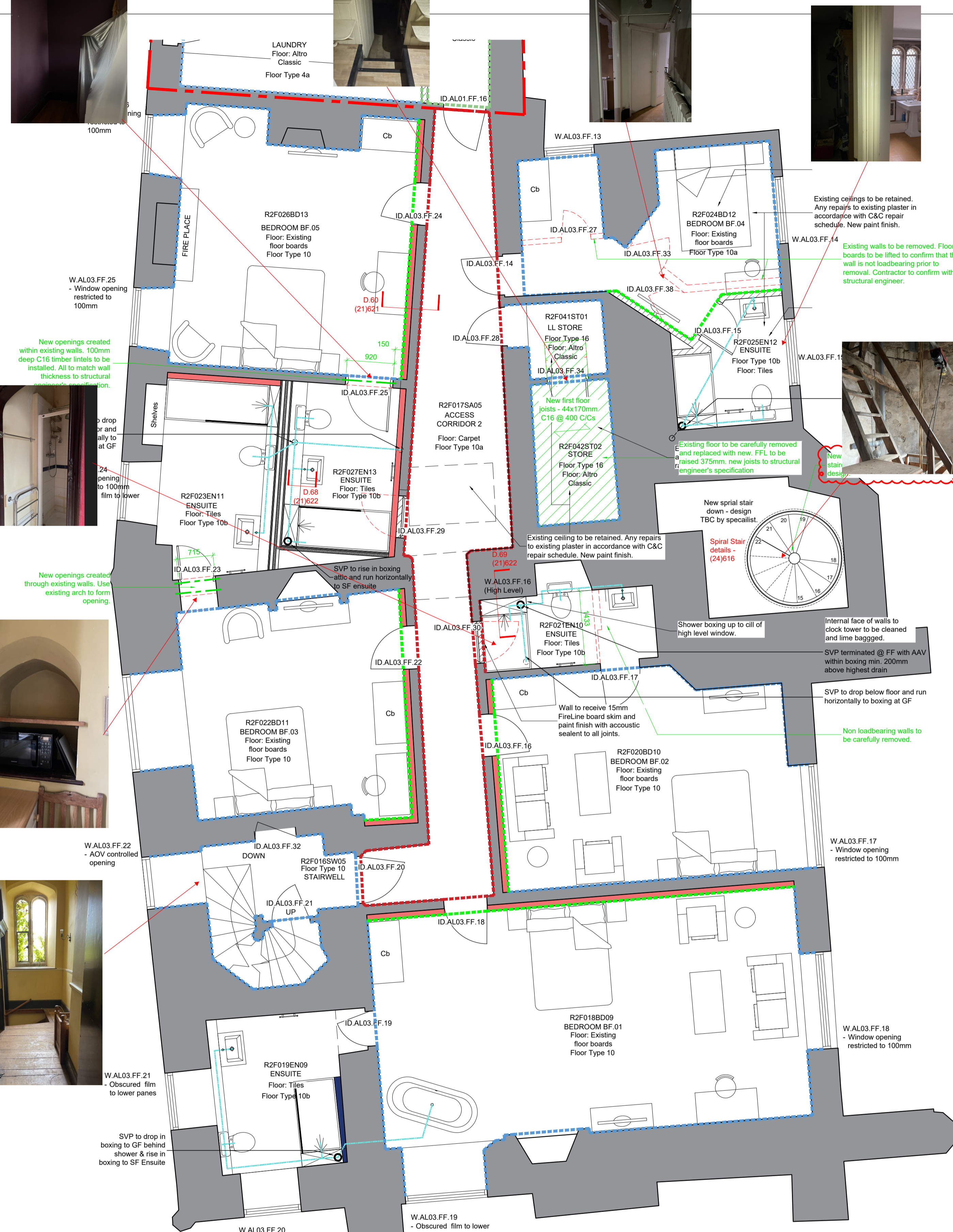
01 DARCY HOUSE (ABBOT'S LODGING) SOUTH WING - FIRST FLOOR PLAN Scale 1:50 @ A1