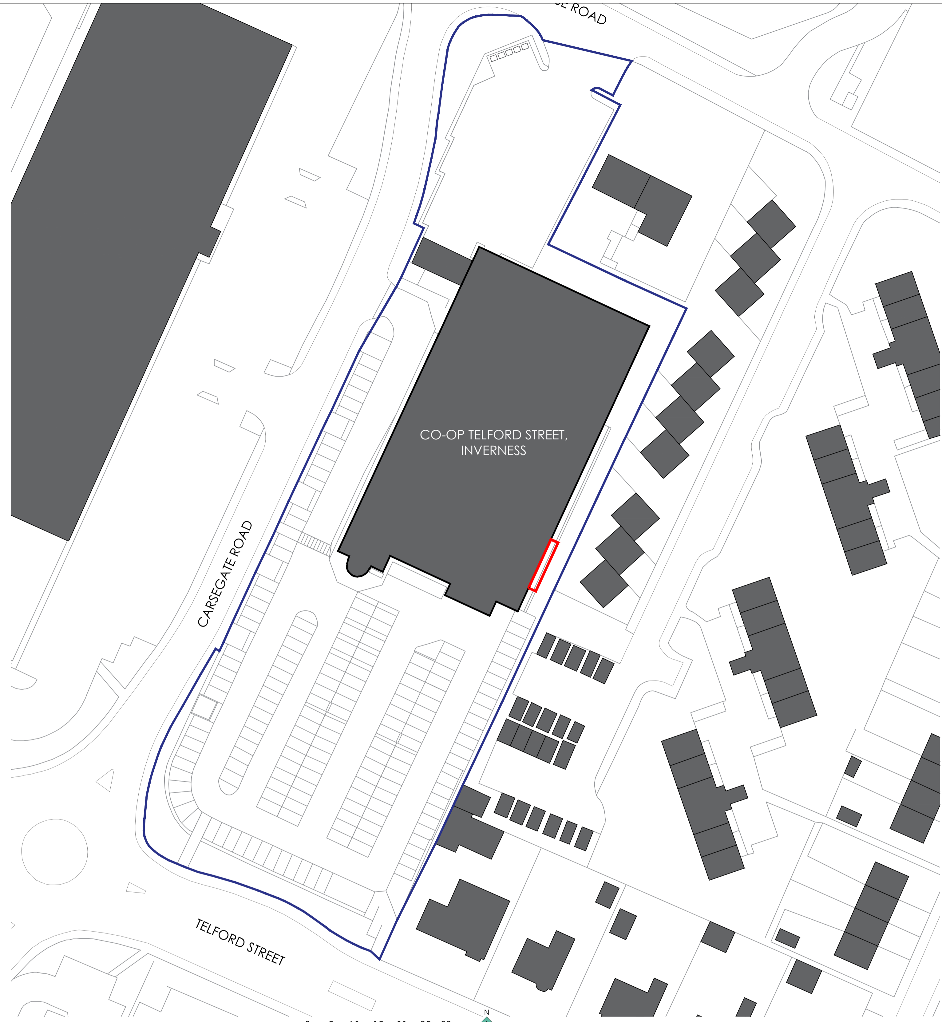
EXISTING SITE PLAN Scale 1/500

All dimensions to be verified on site. Any discrepancies in printed drawings to be brought to attention of wd Harley for clarification. All variations to construction works carried out on site to be brought to our attention prior to carrying out work. ©2020, wd Harley is the author of this document and owns the copyright to it. This document may not be reproduced in any form in whole or part without the prior written permission of wd Harley.