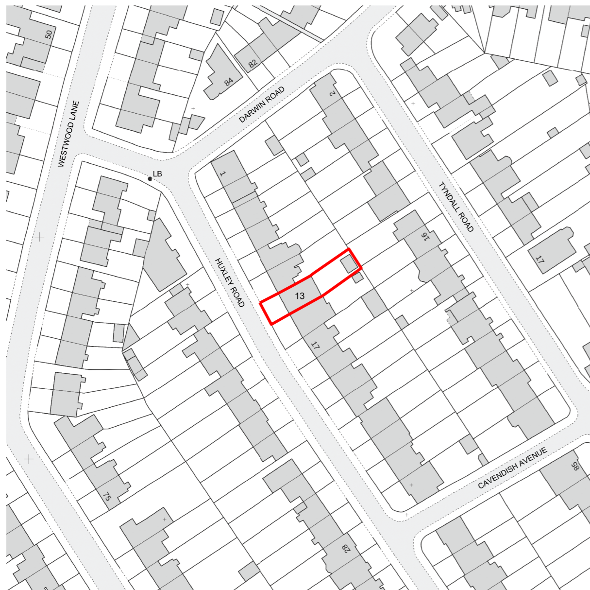
01 BLOCK PLAN SCALE 1:1250

NOTE: 1. Do not scale from these drawings, use dimensions only. 2. Contractors are to check all dimensions prior to commencement on site and notify the architect of any errors, omissions, or discrepancies. 3. Unless otherwise agreed in writing, all rights to use this document are subject to payment in full of all charges. This document may only be used for the express purpose, project and client for which it has been granted and delivered, as notified in writing by Hut and Castle Architects Ltd. This document may not be otherwise used or copied.