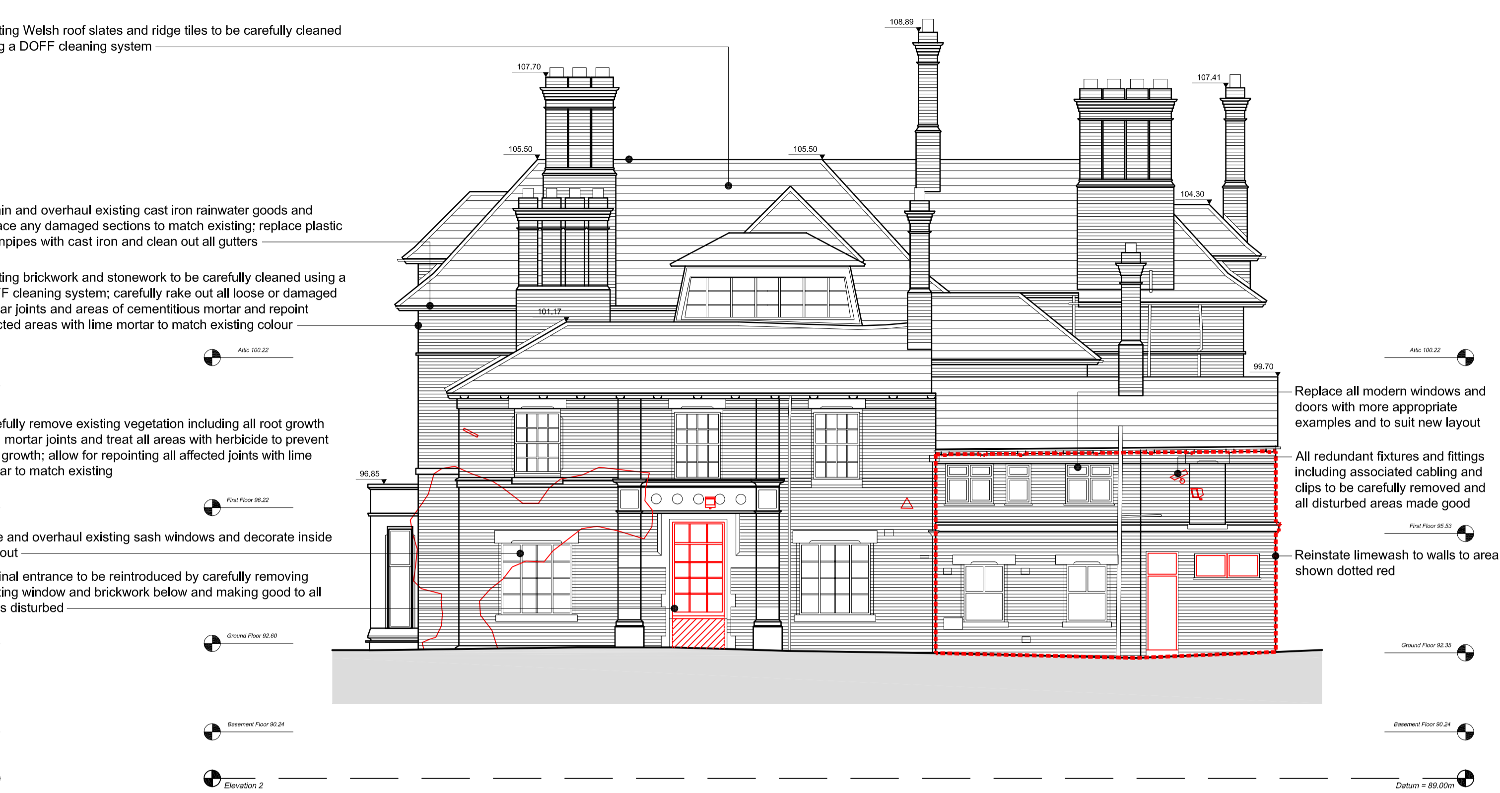
EXISTING EAST ELEVATION 1:100