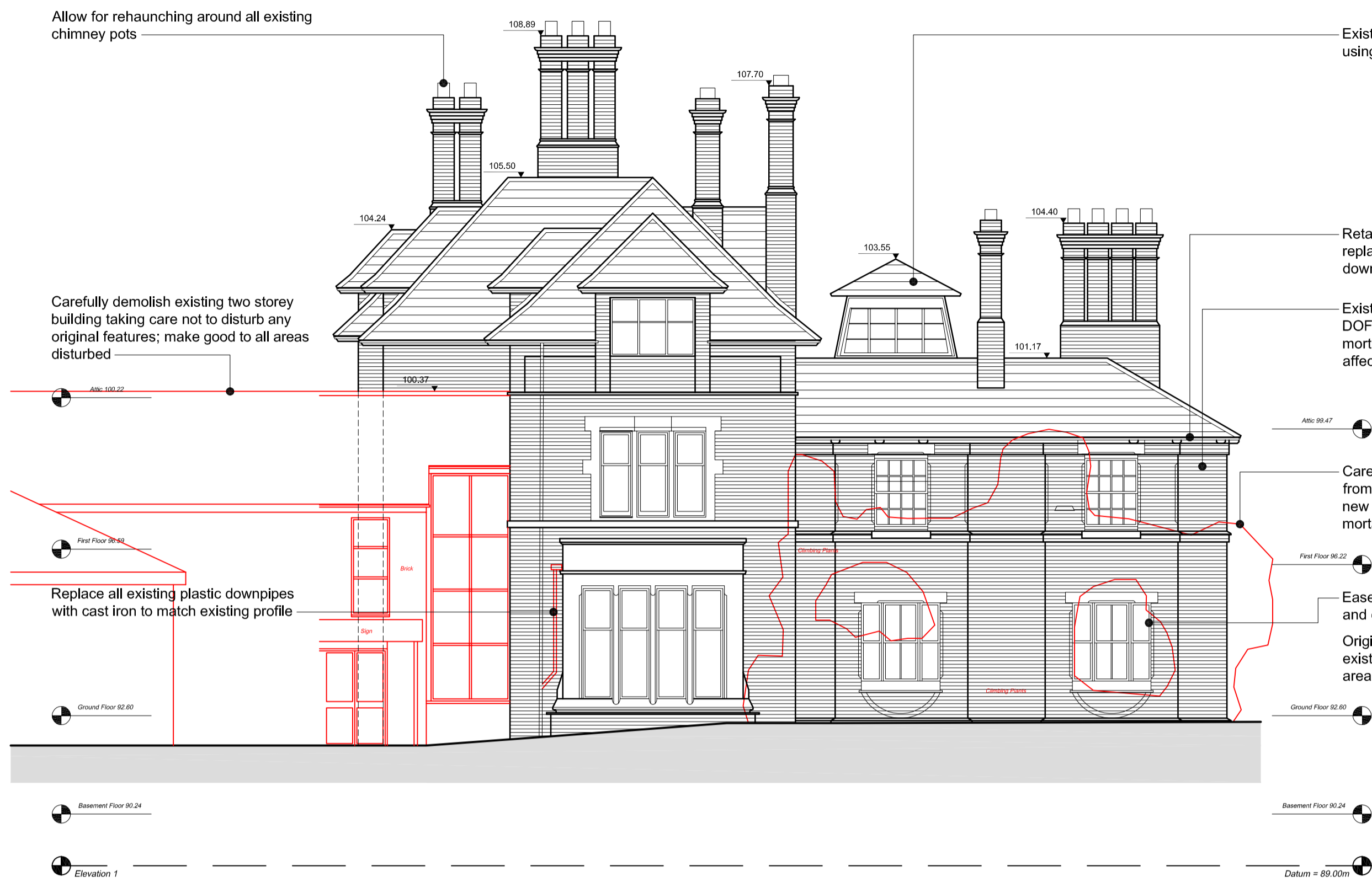
EXISTING SOUTH ELEVATION 1:100