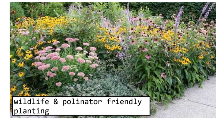
wildlife & pollinator friendly planting