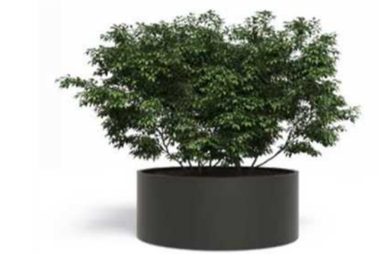
Circular Aluminium tree planters 2000d x 600h