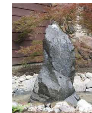
Circulating water feature as focal point to planted border