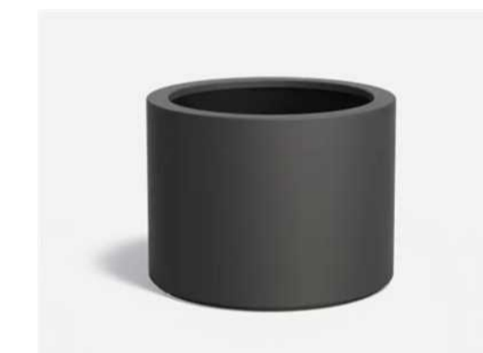
Circular Planters 800d x 600h