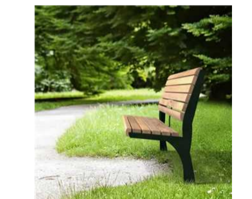
Bench Seating with space for buggy/wheelchair alongside