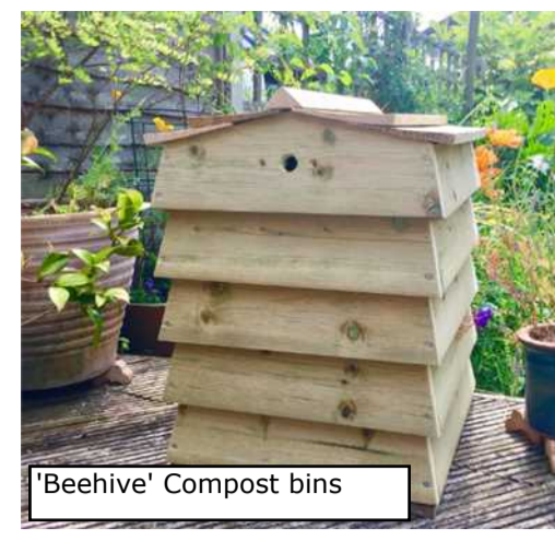
'Beehive' Compost bins