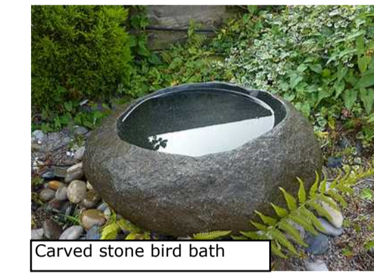
Carved stone bird bath