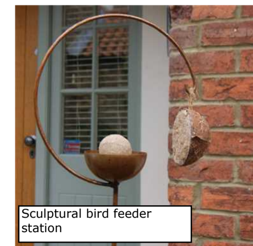
Sculptural bird feeder station