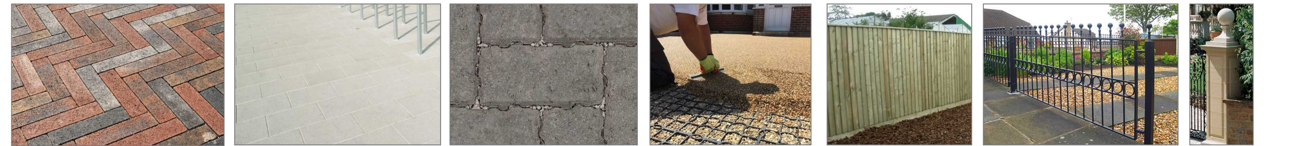
Tobermore Antro Block Paving Marshalls Perfecta slab paving Marshalls Piora permeable block paving to parking bays Resin bound aggregate paths with steel edge and no-dig construction 2m close board fencing with matching gate 1.2m Ball-topped railings Entrance gate pillars - Haddonstone or similar approved

Client: MACCO LIVING Project: Proposed Care Home Development - Station Road, Wigston Drawing: Landscape Layout Scale: 1:200 @ A1 (All dimensions must be checked on site) Drawing: 2309MAC-WIG-1 Date: 24/11/23 Version: C Drawn by: AJC 22 Gladstone Street Loughborough Leicestershire LE11 1NS design@alancapeling.co.uk 0777 5758949 www.alancapeling.co.uk