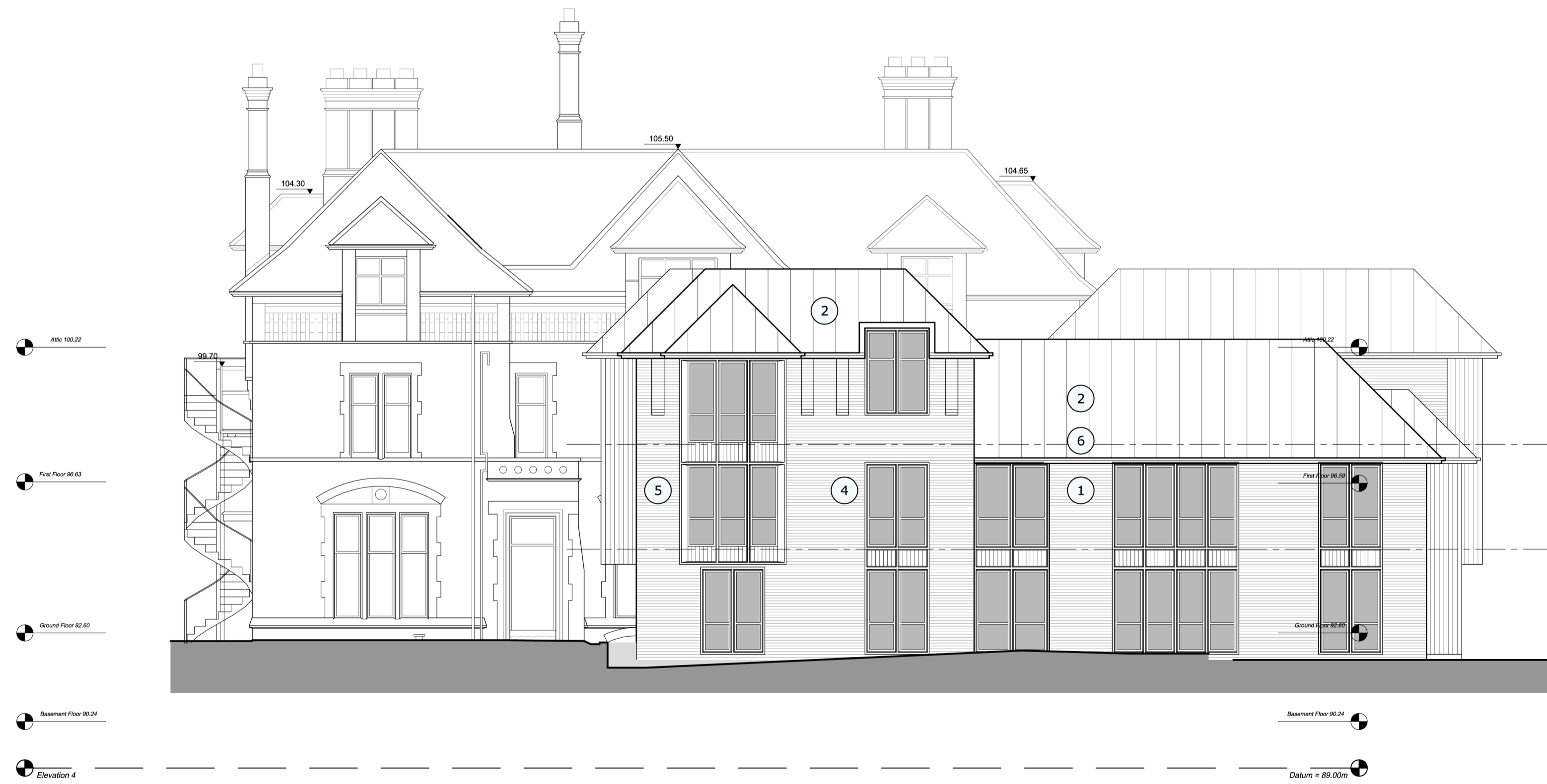
PROPOSED WEST ELEVATION 1:100