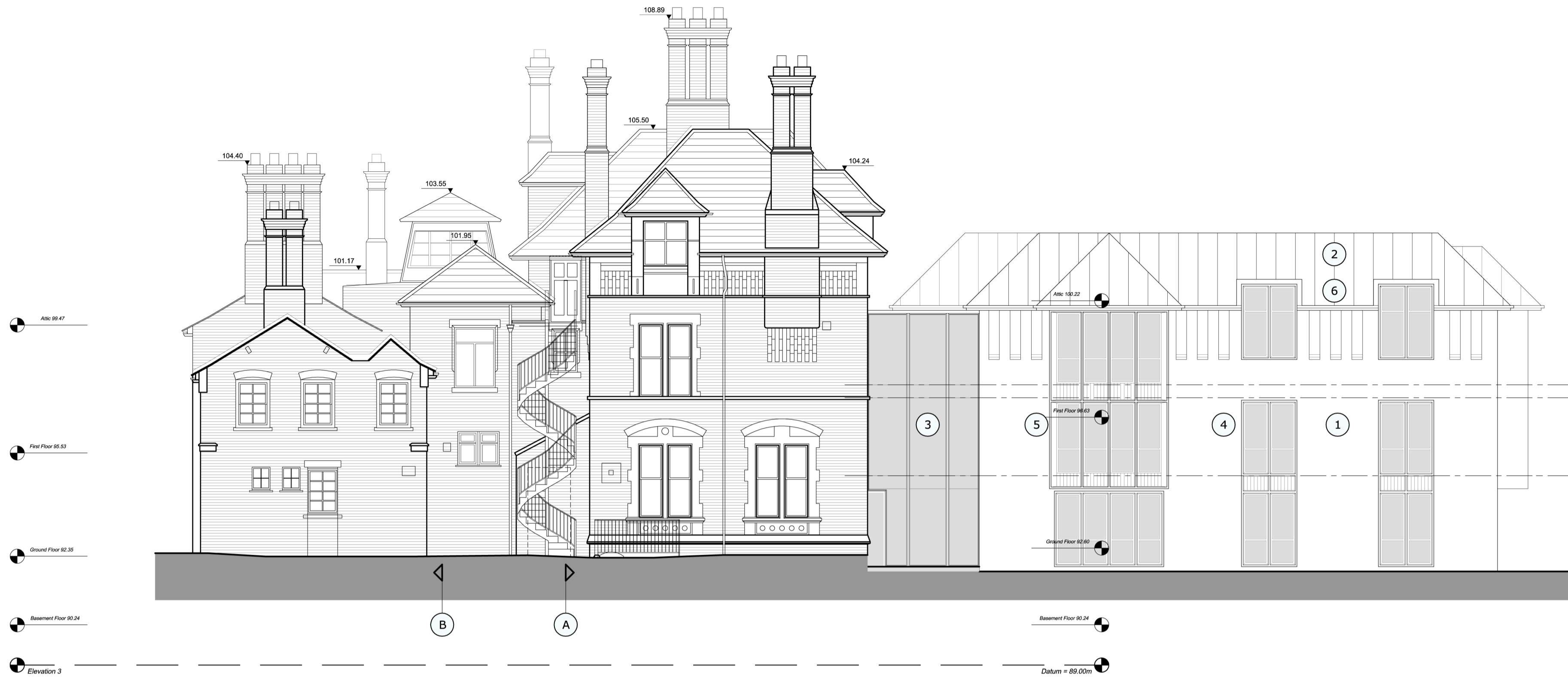
PROPOSED NORTH ELEVATIONS 1:100