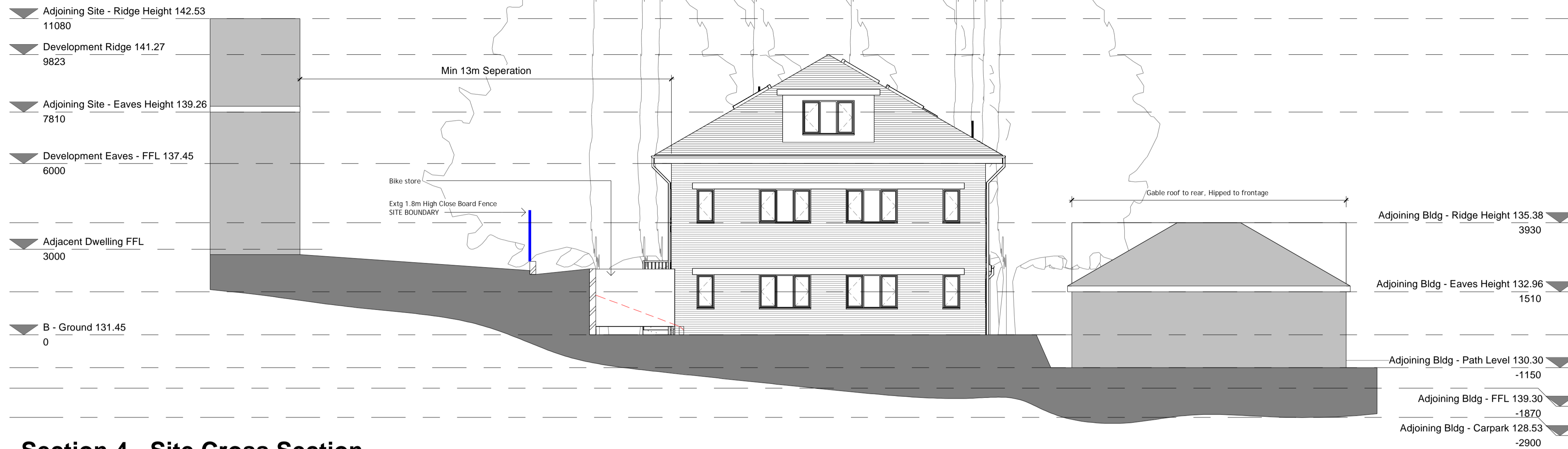
Section 4 - Site Cross Section 1 : 100