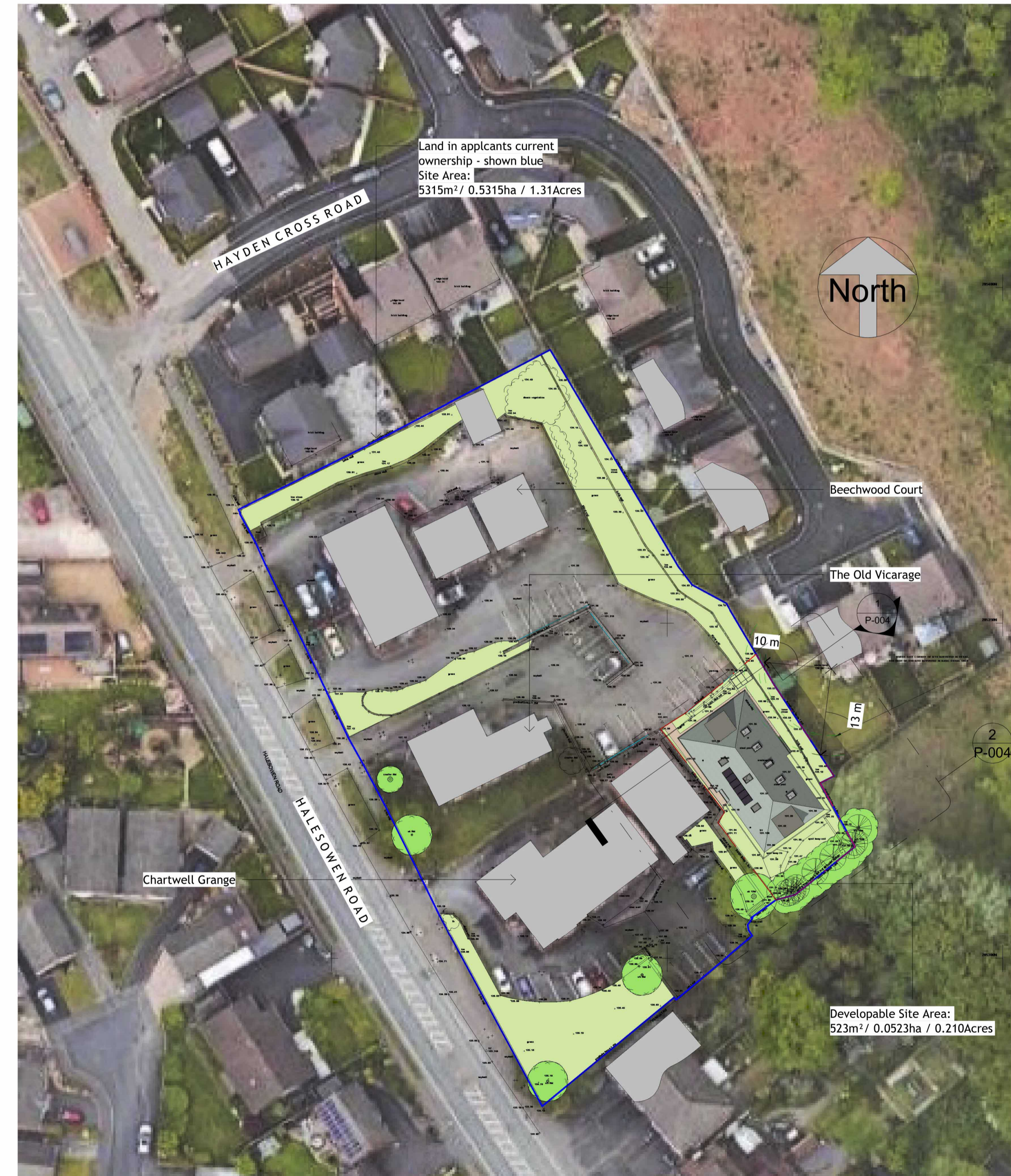
Site - Proposed 1 : 500