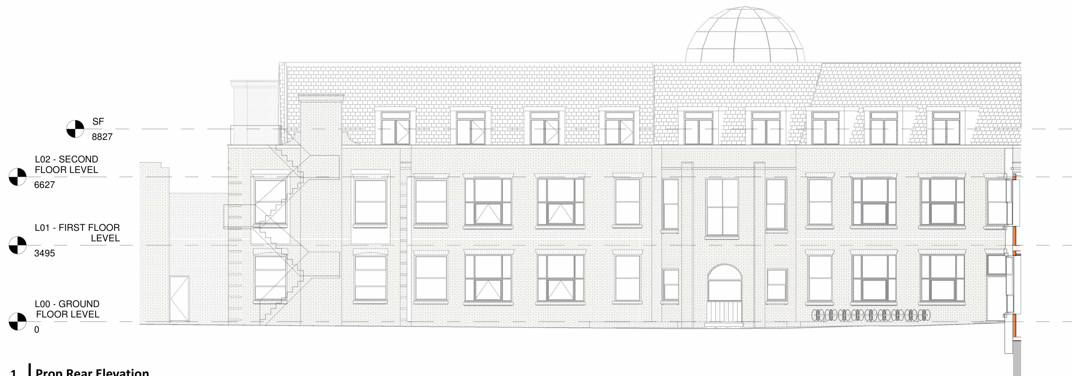
1 Prop Rear Elevation 1 : 100 A-301

Notes 1. This drawing has been prepared in accordance with the scope of W13 Ltd's appointment with its client and is subject to the terms and conditions of that appointment. W13 Ltd accepts no liability for any use of this document other than by its client and only for the purposes for which it was prepared and provided. 2. If received electronically it is the recipient's responsibility to print to the correct scale. Only written dimensions should be used.