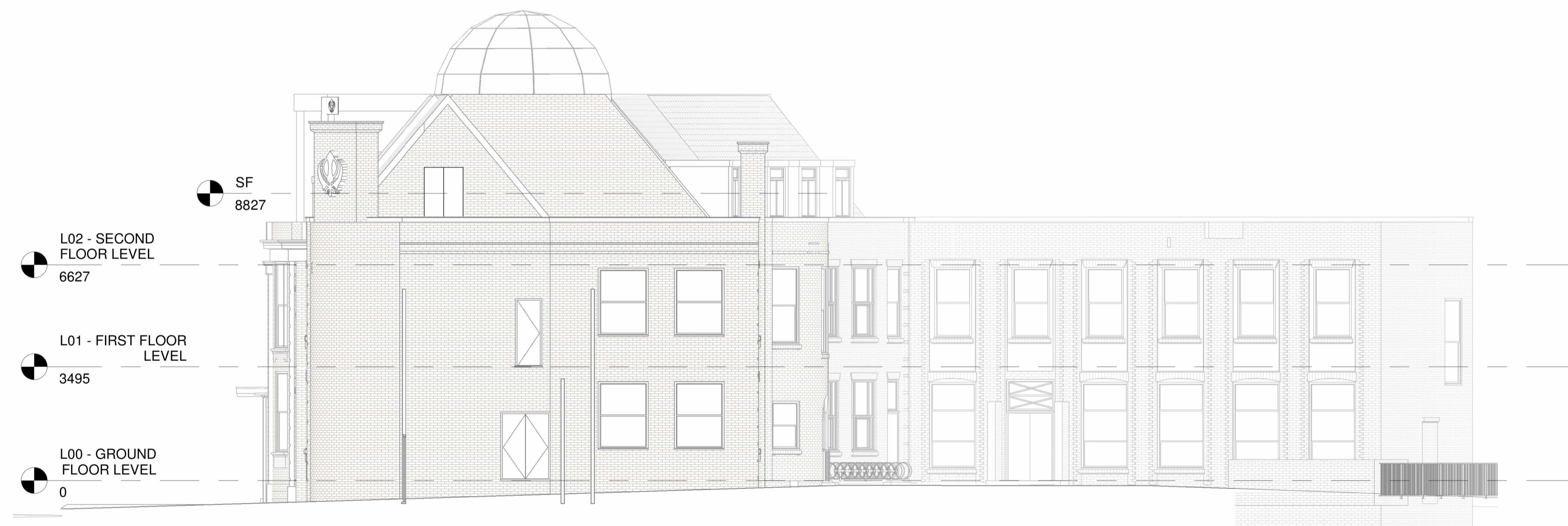
2 Prop Side Elevation/Section 1 : 100 A-301

A 12.07.2018 Elevations updated as per Client comment. HSJ