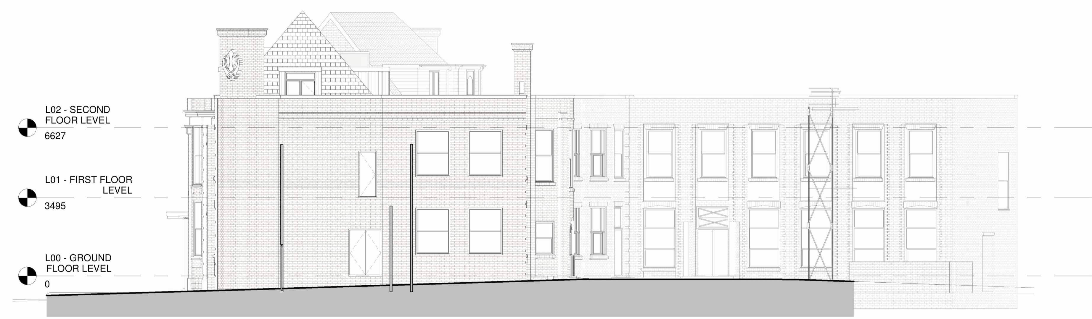
2 | Side Elevation/Section 1 : 100 | A-111