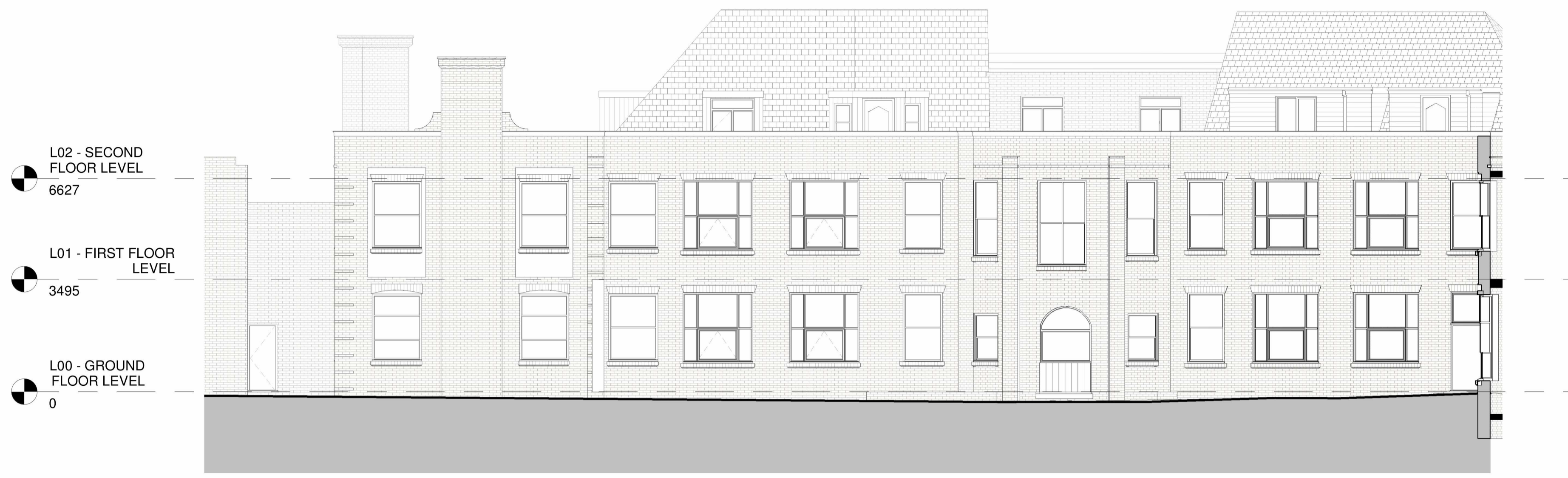
1 | Rear Elevation 1 : 100 | A-111