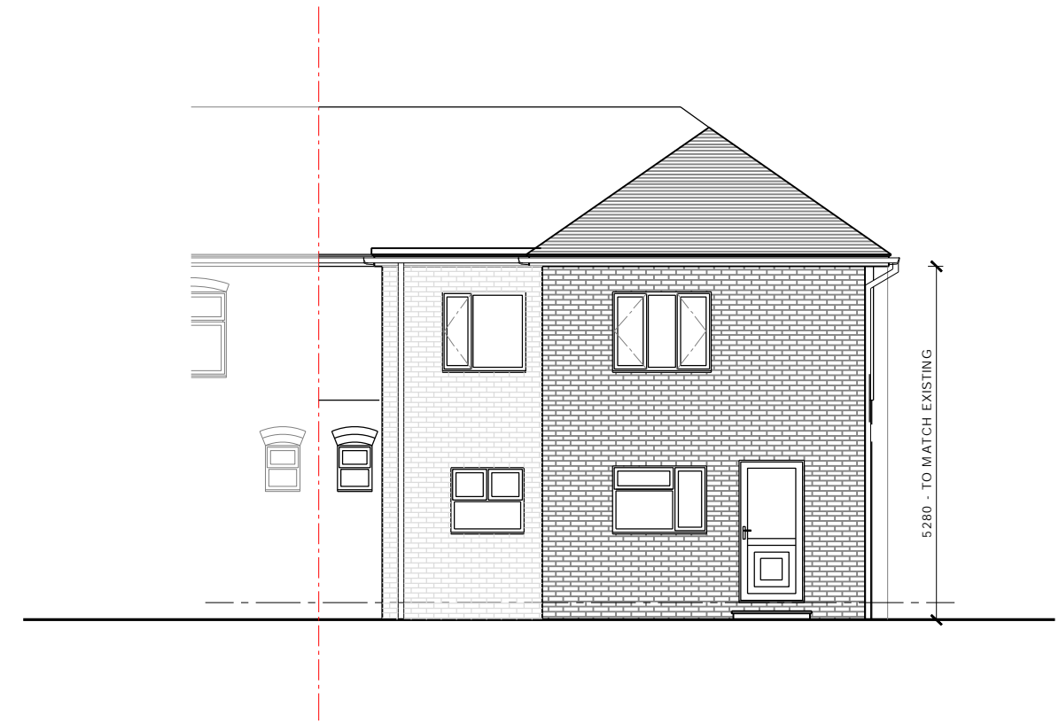
2 Proposed Rear Elevation 1:100 @A2