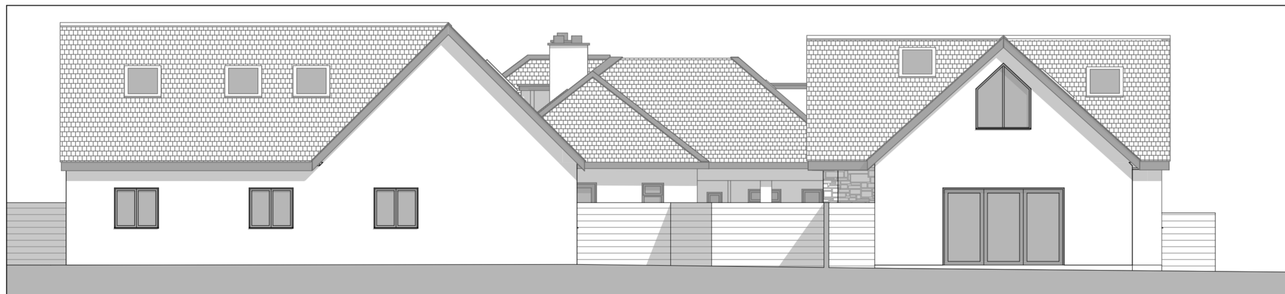
South Elevation 1:100