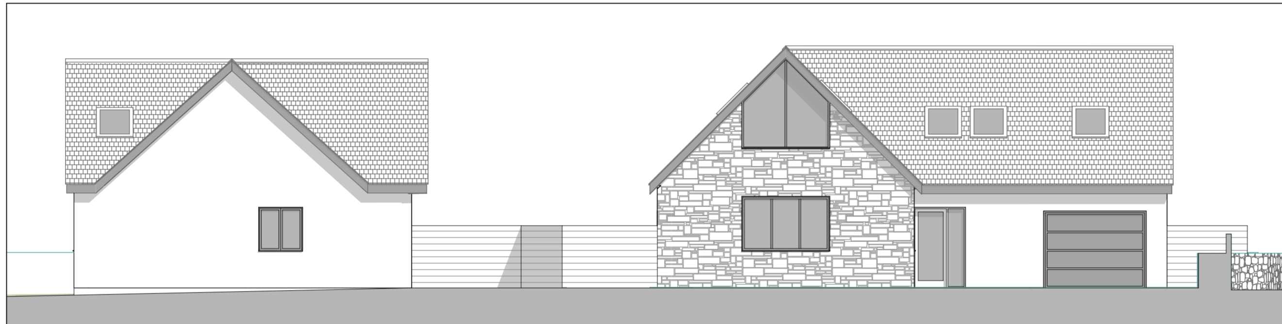
North Elevation 1:100