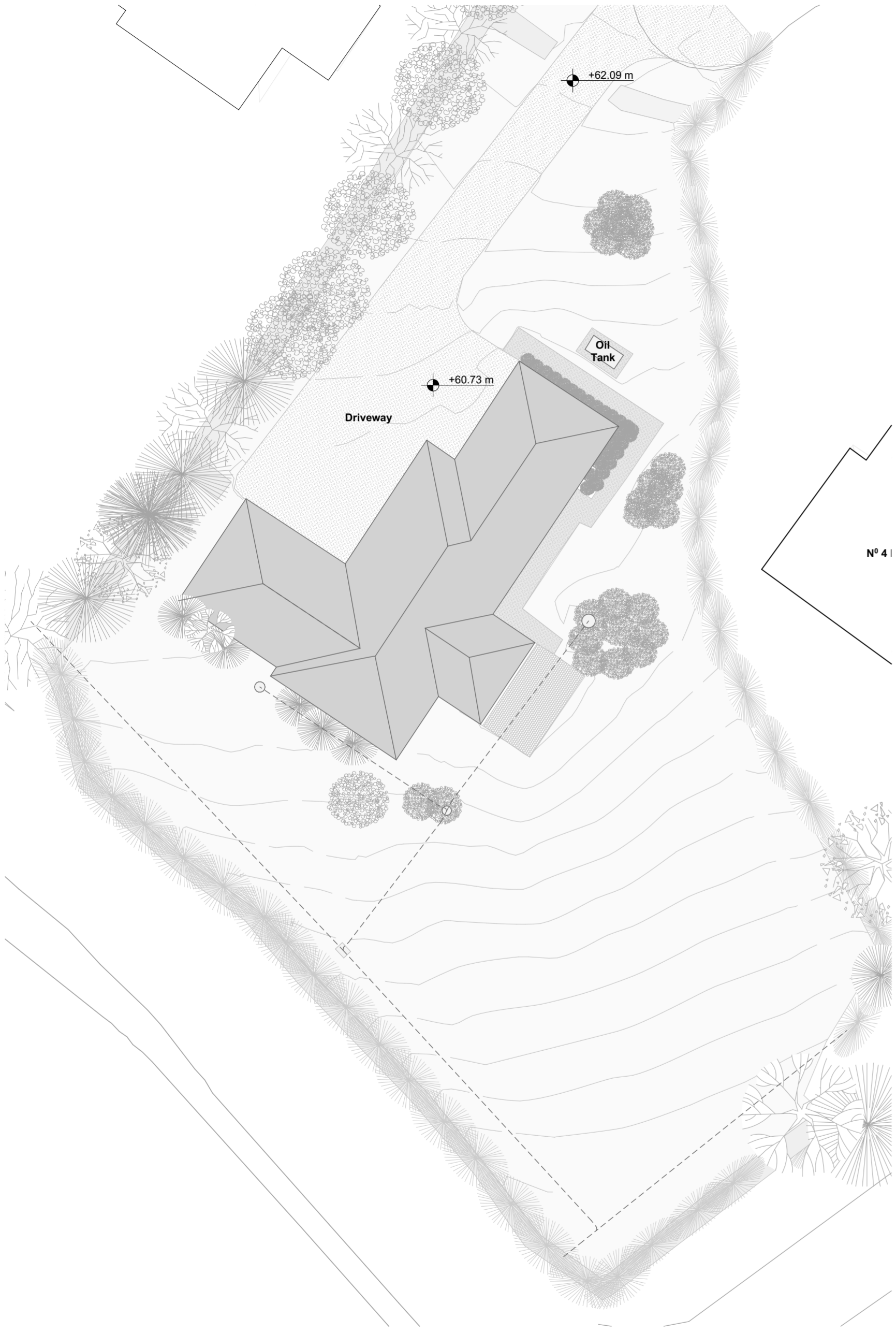
EXISTING SITE PLAN 1:200 1:200 1m 5m 10m 20m