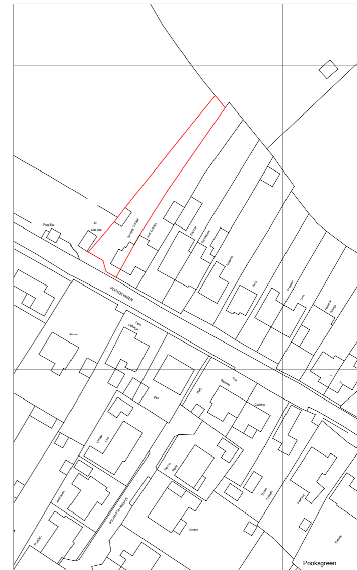
Proposed Location Plan - Scale 1:1250