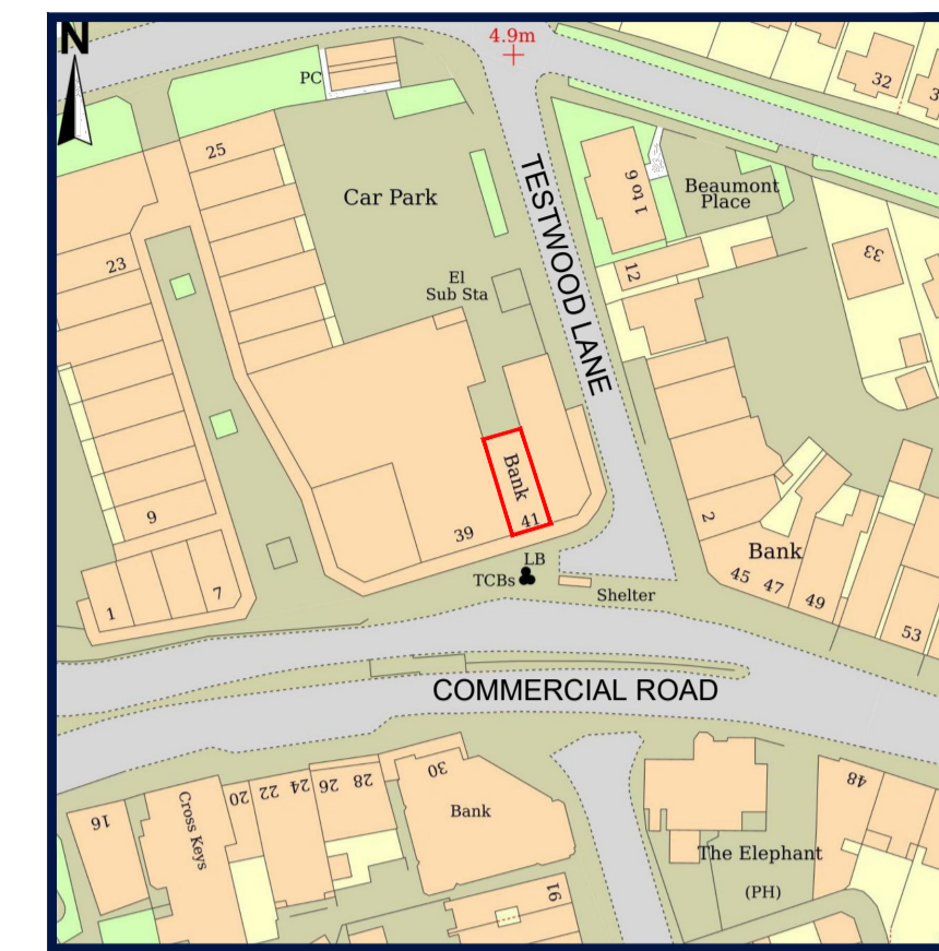
LOCATION PLAN - 1:1250 @ A1