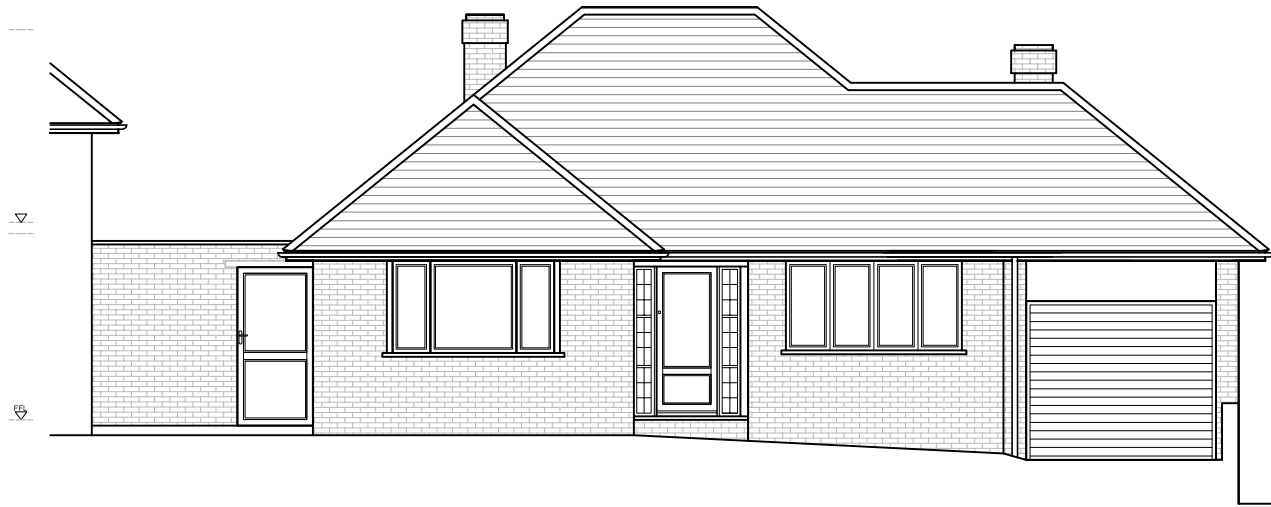
EXISTING FRONT (NORTH-EAST) ELEVATION scale 1:100