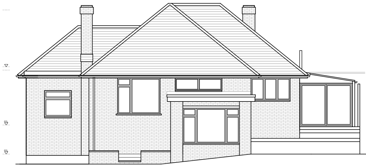
EXISTING REAR (SOUTH-WEST) ELEVATION scale 1:100