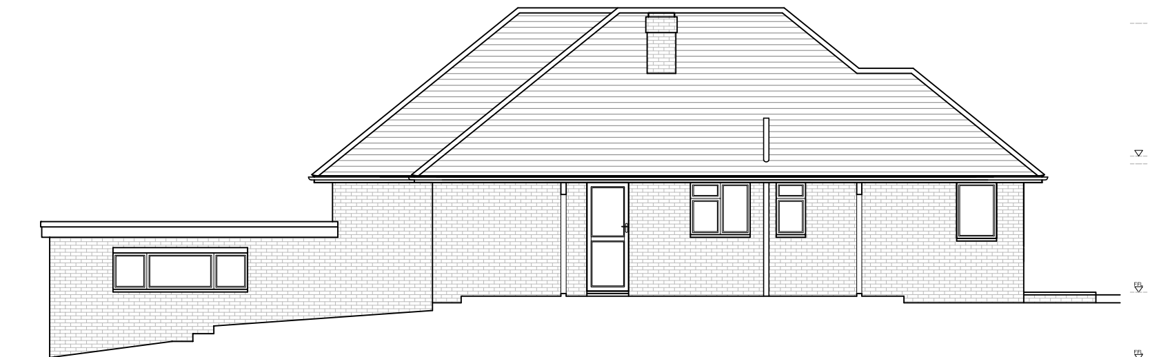
EXISTING SIDE (SOUTH-EAST) ELEVATION scale 1:100