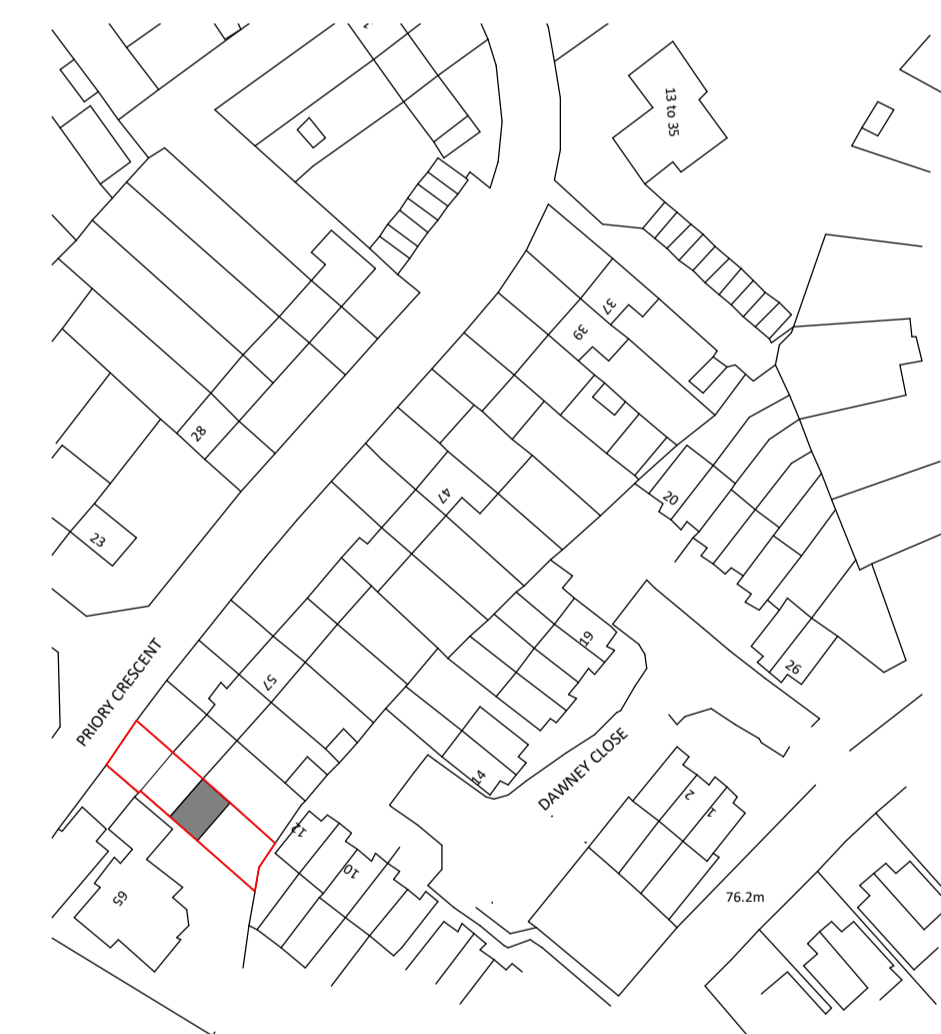
Site Plan 1 : 1250