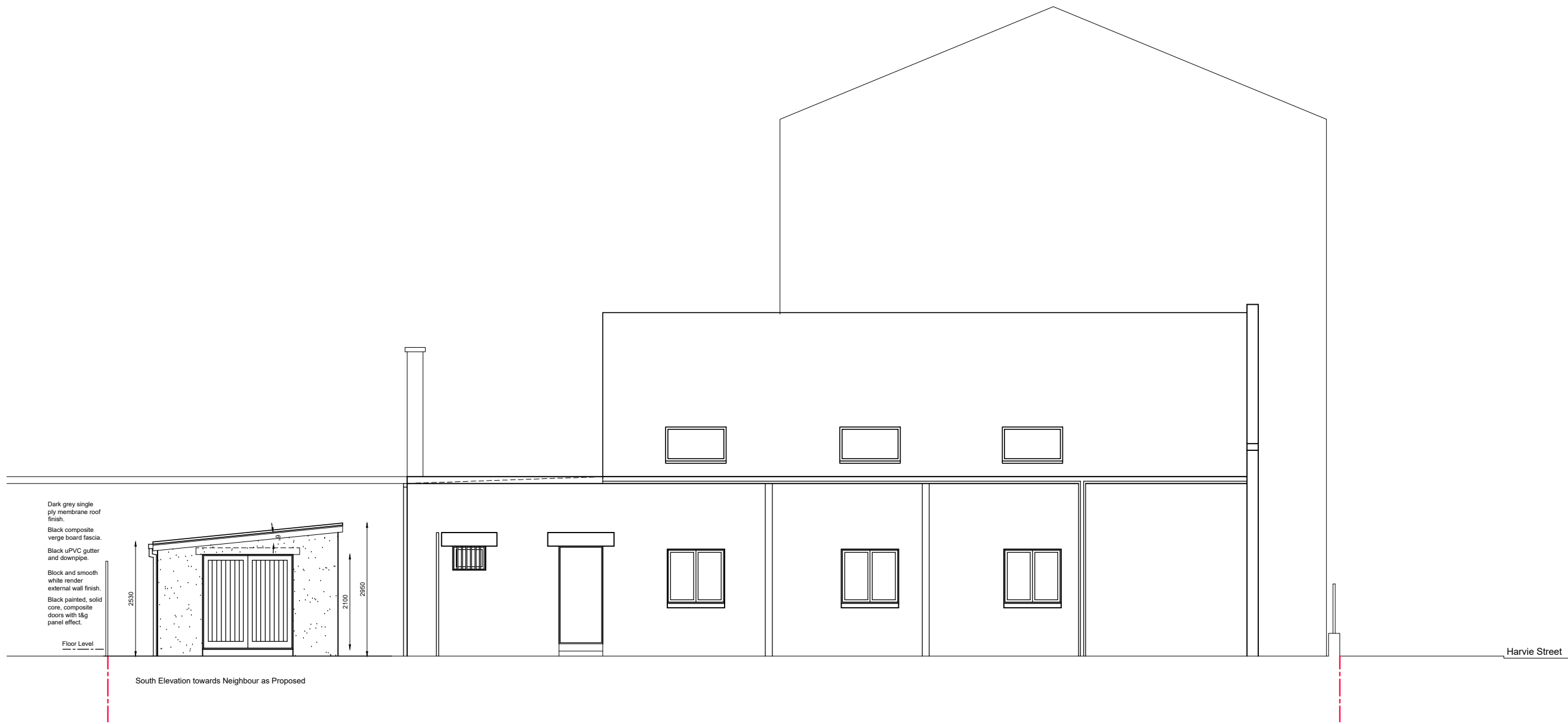
South (Side) Elevation as Proposed @ 1:100

Notes: Do not scale from this drawing. If in doubt consult the architect. Surrounding context not surveyed – for illustrative purposes only.