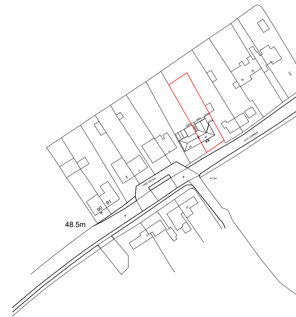
Proposed Location Plan 1:1250 1:1250 SCALE (m)