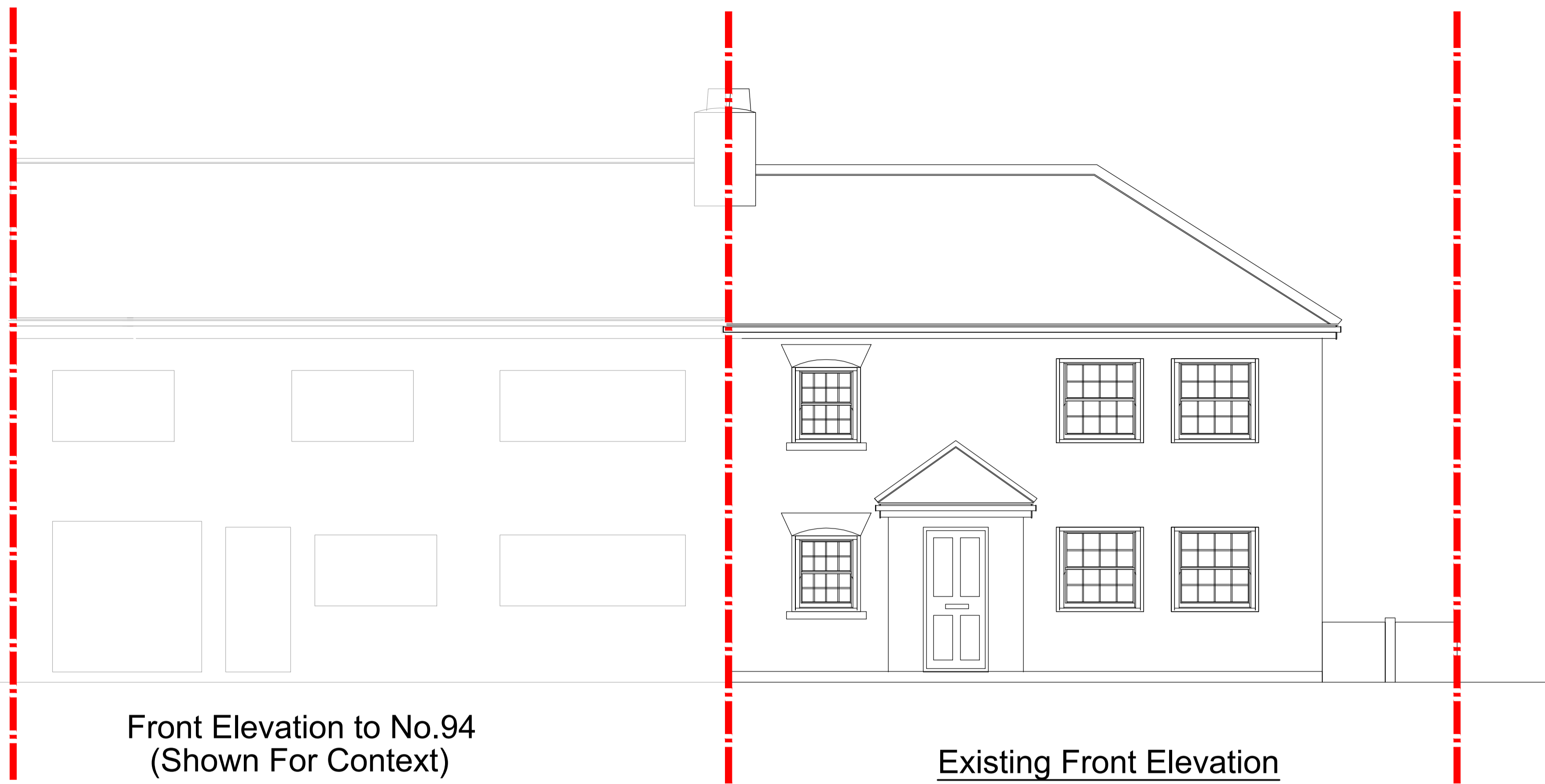
Front Elevation to No.94 (Shown For Context)

THIS DRAWING IS SUBJECT TO COPYRIGHT AND MUST NOT BE REPRODUCED OR USED IN ANY FORM WITHOUT PRIOR WRITTEN PERMISSION FROM SWAL ENGINEERING LTD.