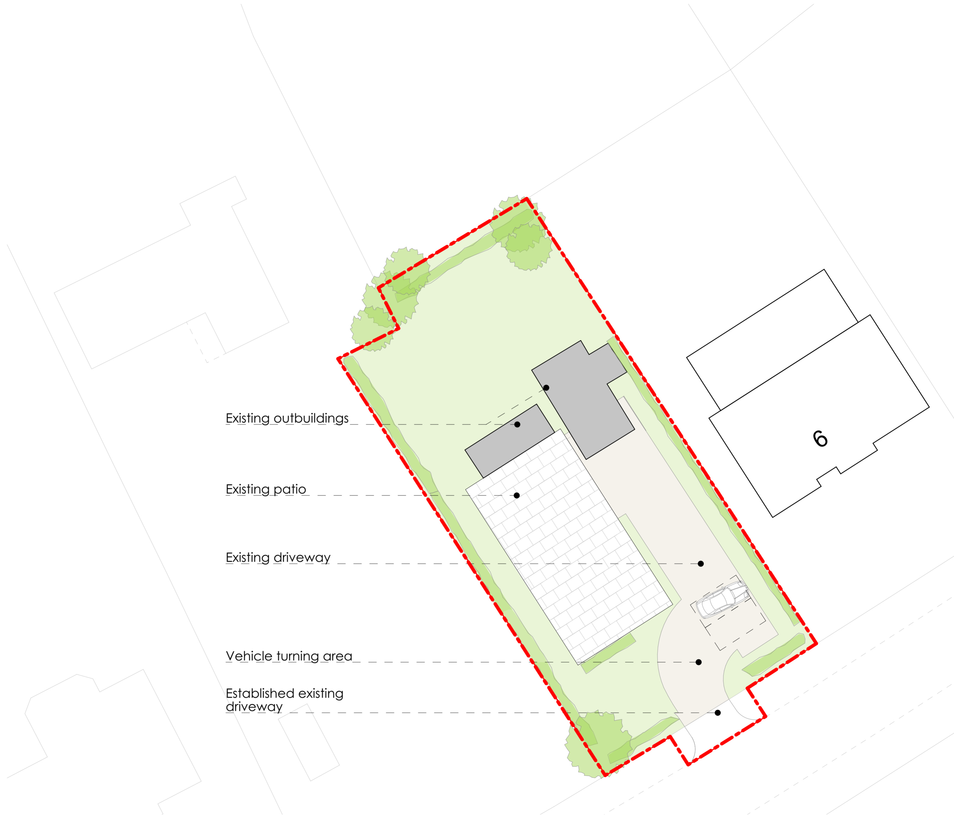
Existing Block Plan/Site Plan