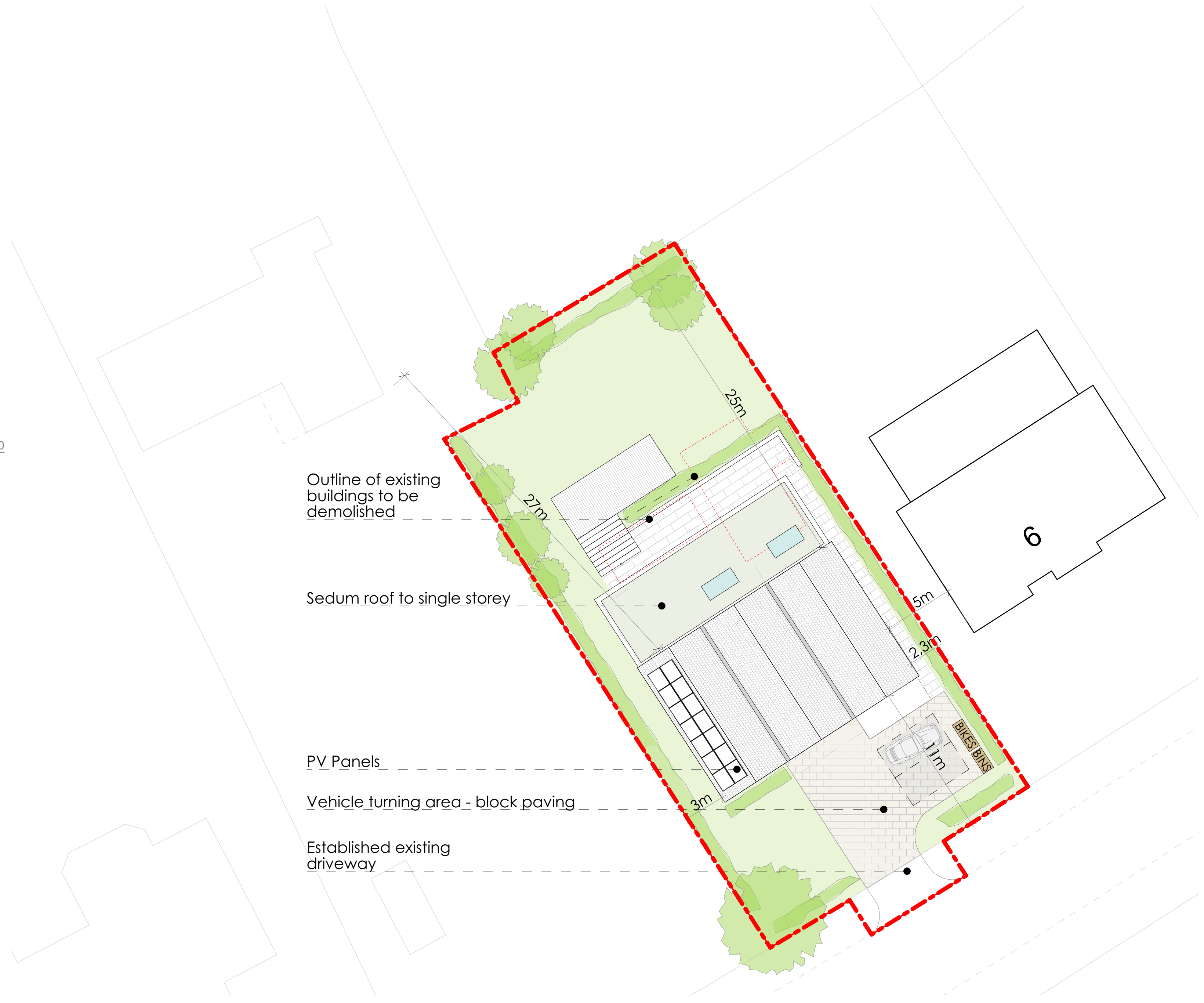
Block Plan/Roof Plan/Site Plan