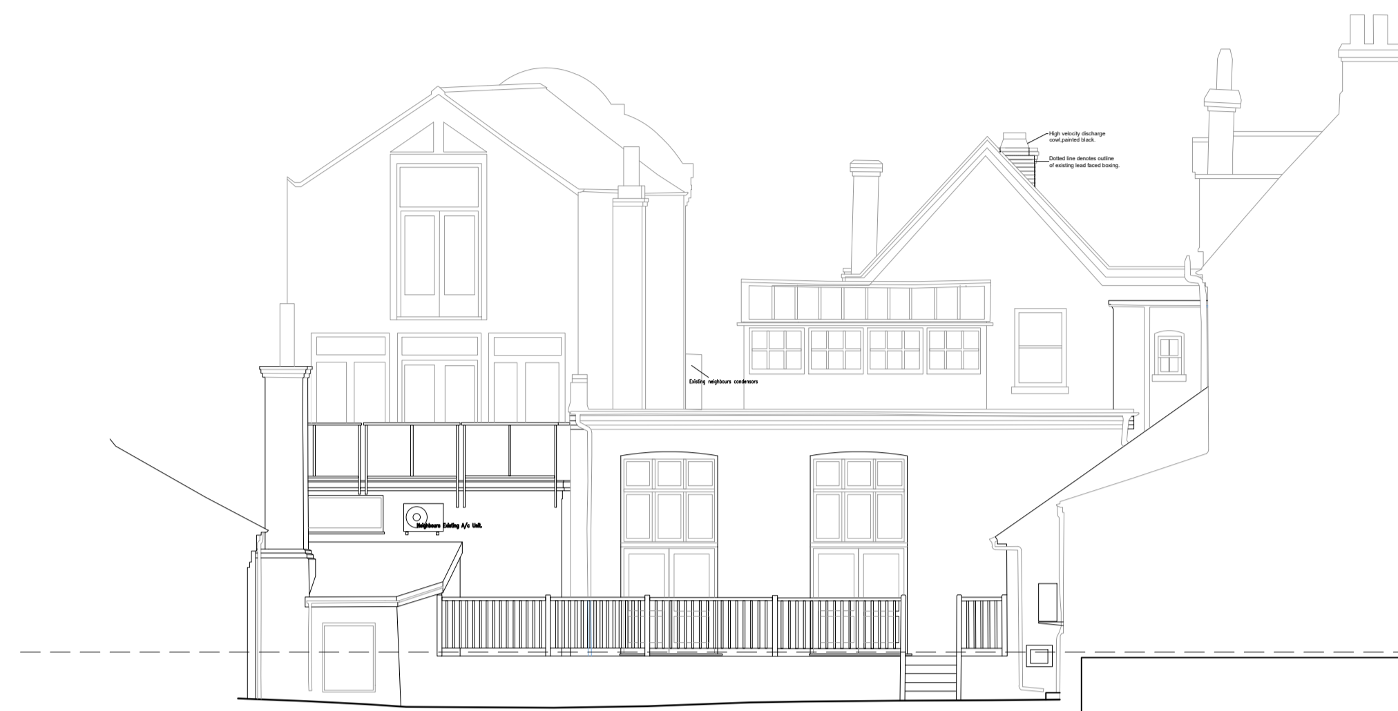
Proposed Elevation to Courtyard

Note :- This drawing must not be scaled. For Planning Purposes only