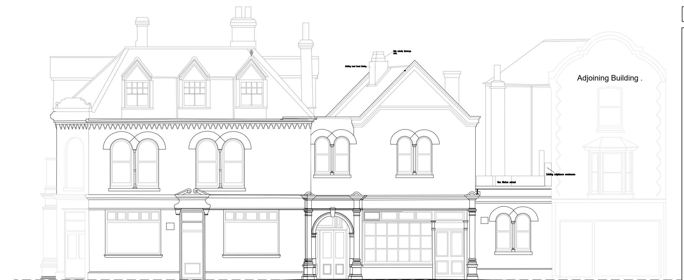
As Built Elevation to Harbour Road.