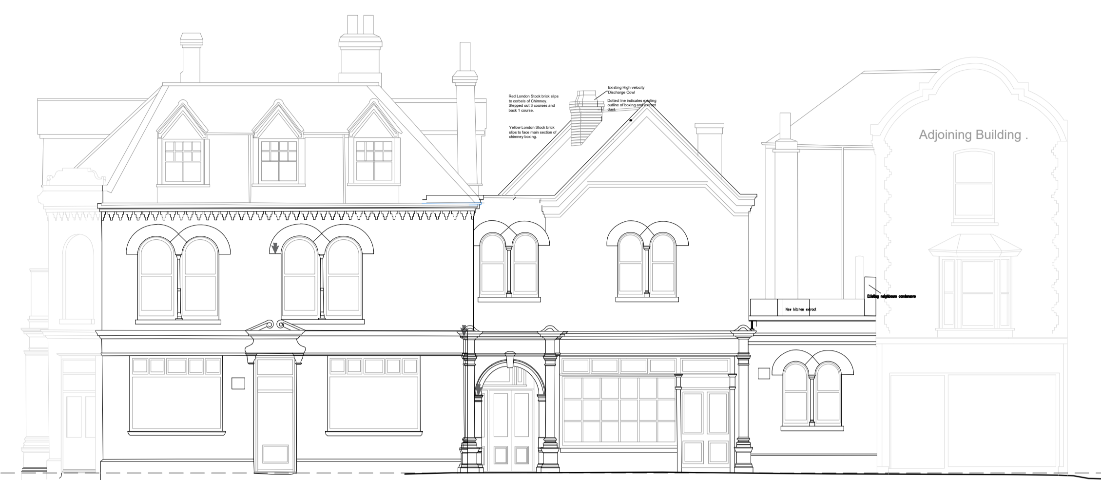
Proposed Elevation to Harbour Road.