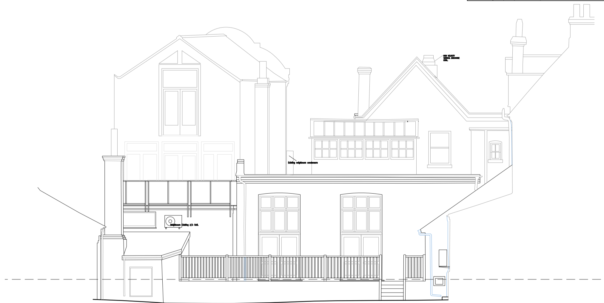
As Built Elevation to Courtyard