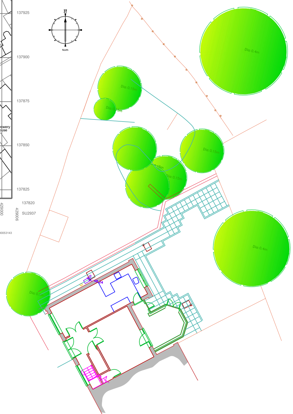
Existing Site Plan 1:200