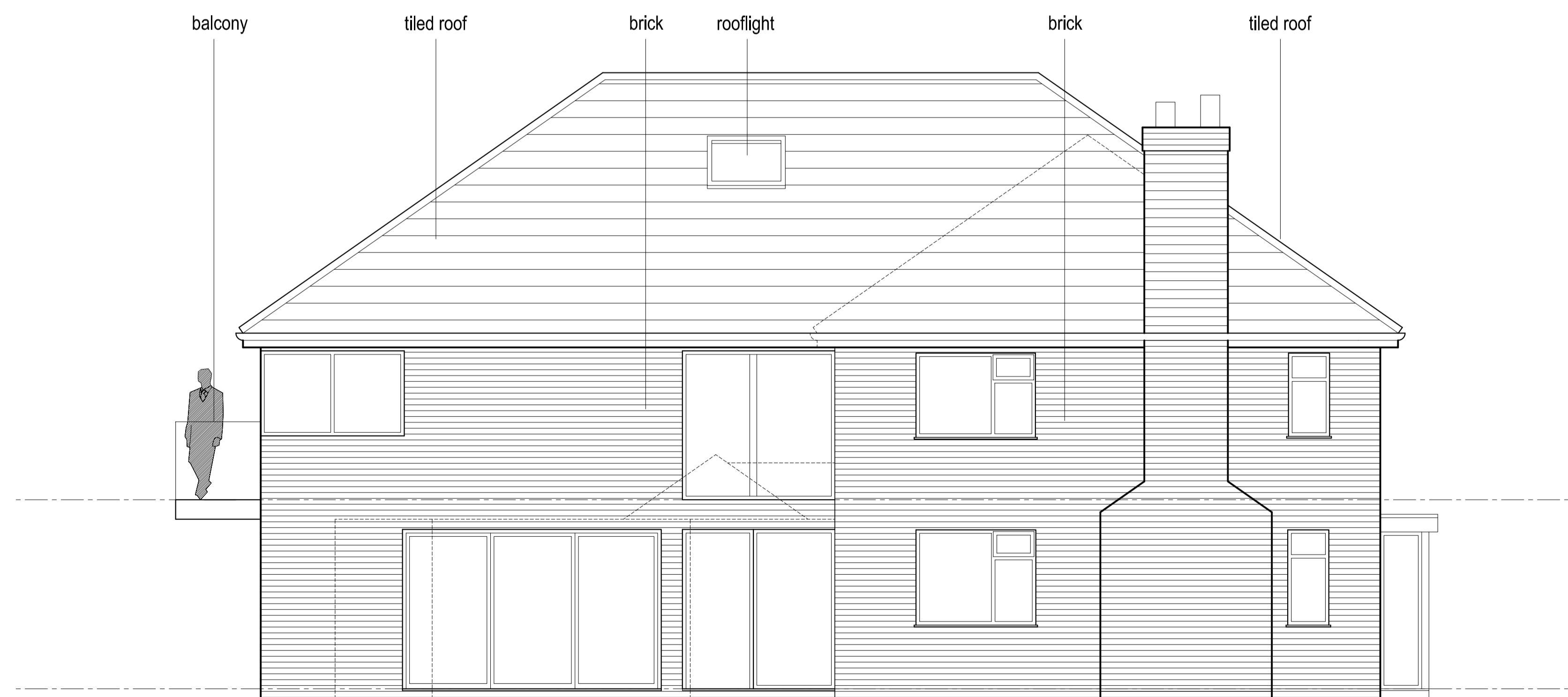
PROPOSED SOUTH WEST SIDE ELEVATION 1:50