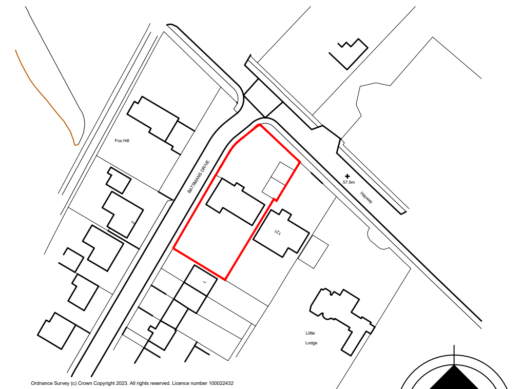
Site Location Plan Scale 1:1250