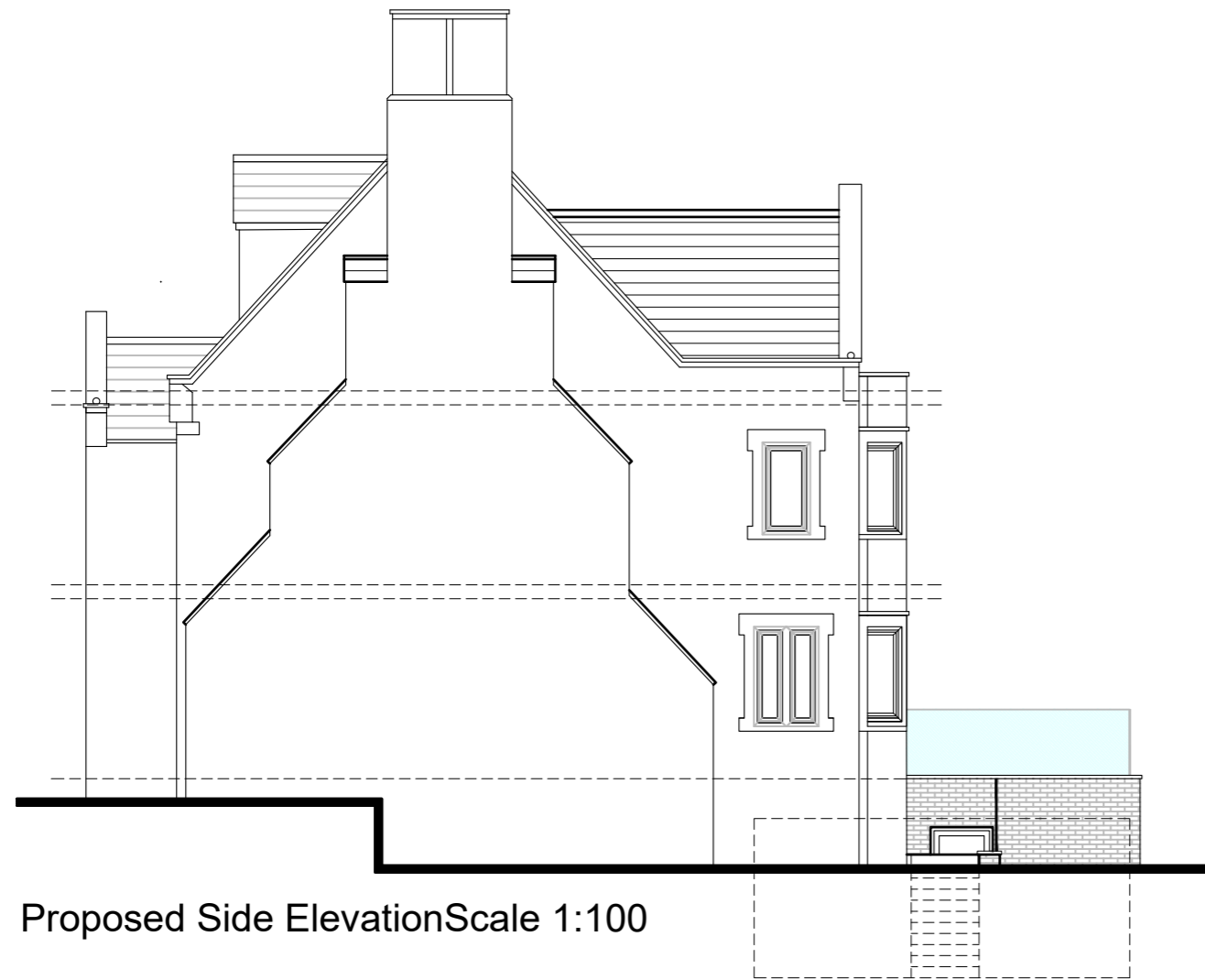
Proposed Side Elevation Scale 1:100