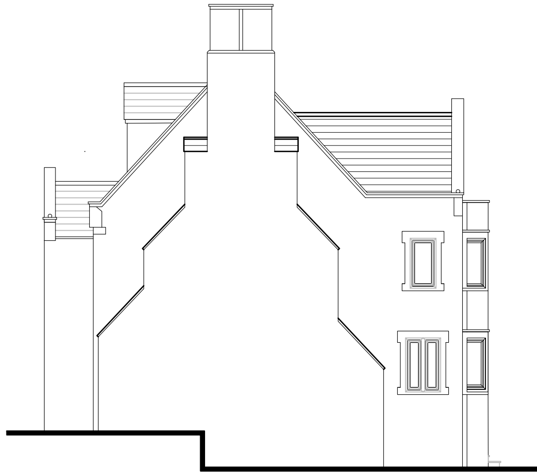
Existing Side Elevation Scale 1:100