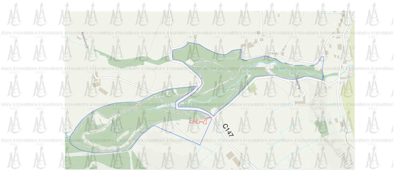
Location Plan - Scale 1:10000