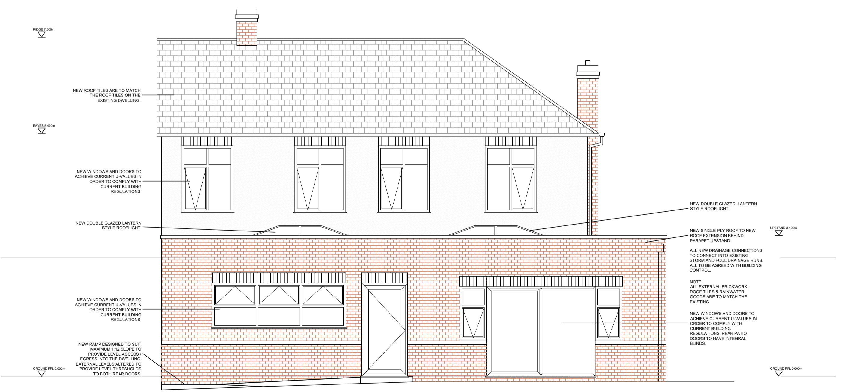
REAR ELEVATION (SOUTH FACING)