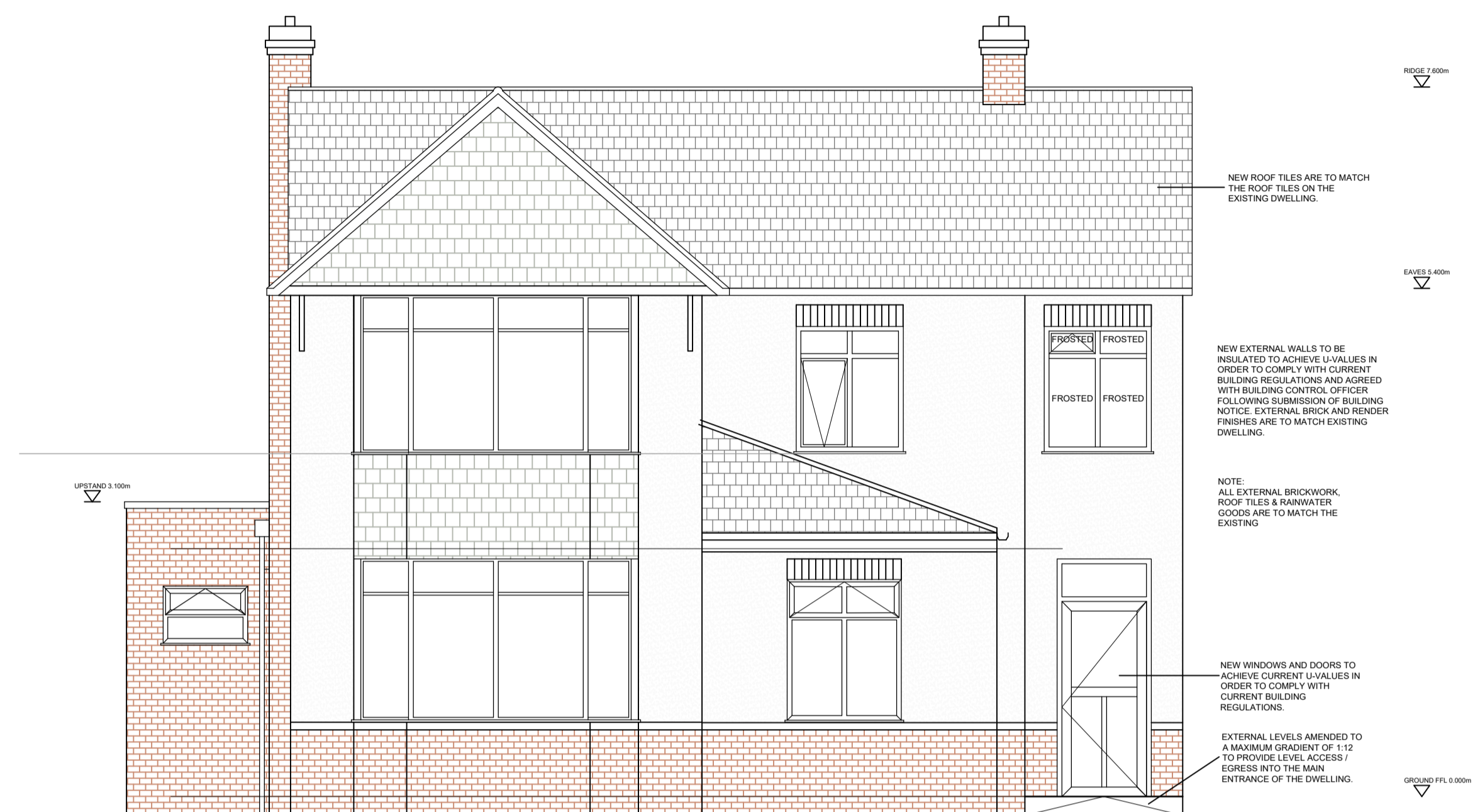
FRONT ELEVATION (EAST FACING)

THIS DRAWING IS COPYRIGHT. DIMENSIONS ARE NOT TO BE SCALED FROM THIS DRAWING ELECTRONIC DATA IS NOT TO BE AMENDED/DELETED WITHOUT THE DESIGNER PERMISSION ALL FIXINGS, TO BE DESIGNED BY APPROPRIATE SPECIALIST SUB-CONTRACTOR DETAIL DRAWINGS AT LARGER SCALE TAKE PRECEDENCE OVER GENERAL ARRANGEMENT DRAWINGS A 09.10.23 JT UPDATED TO SUIT CLIENT COMMENTS. B 26.11.23 JT UPDATED FIRST FLOOR SHOWER WINDOW TO FROSTED GLAZING. C 03.12.23 JT ADDED SCALEBAR.