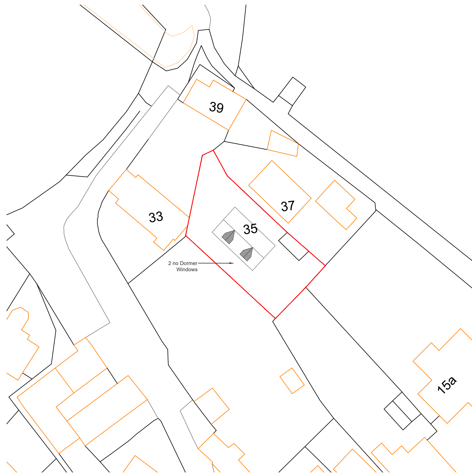
Proposed Site Plan