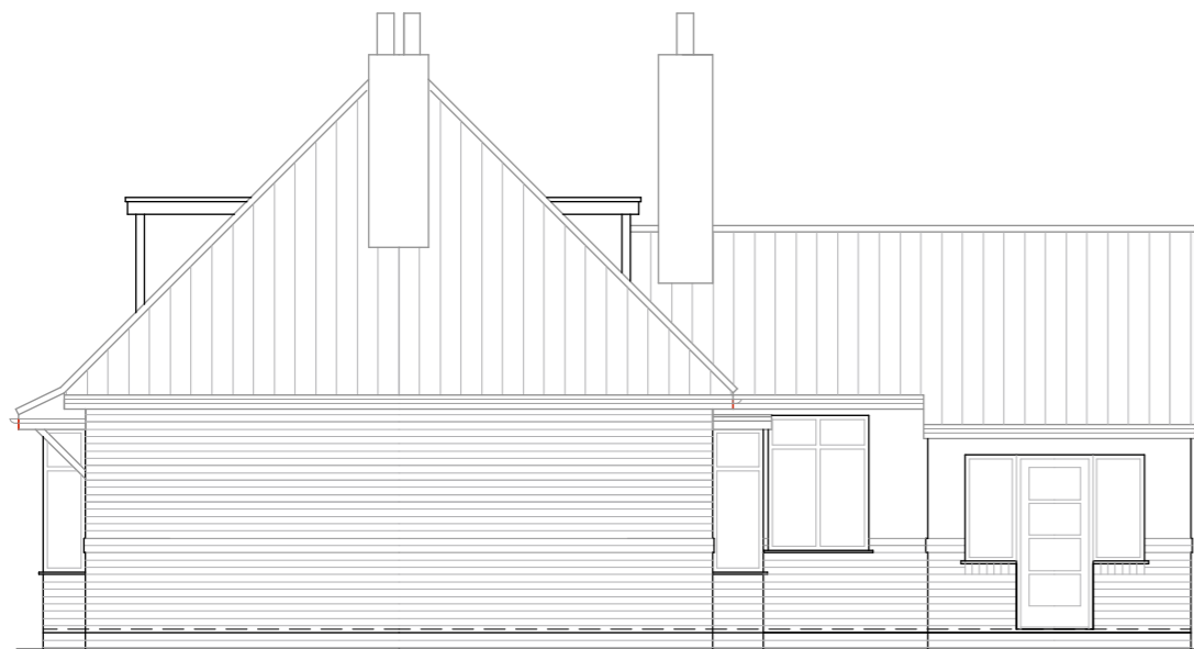
Side Elevation 2