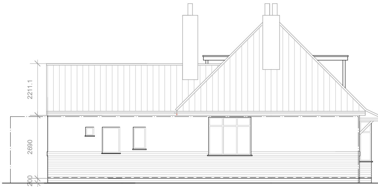
Side Elevation 1