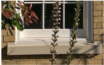
York stone window heads and cills