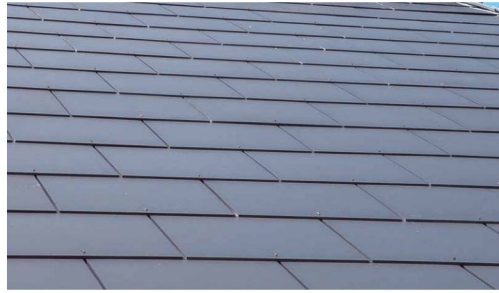
Fibre cement slate effect roof tiles in Graphite Grey