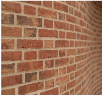
Holt Blend Red Bricks