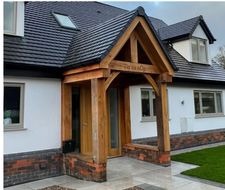
Timber framed storm porch