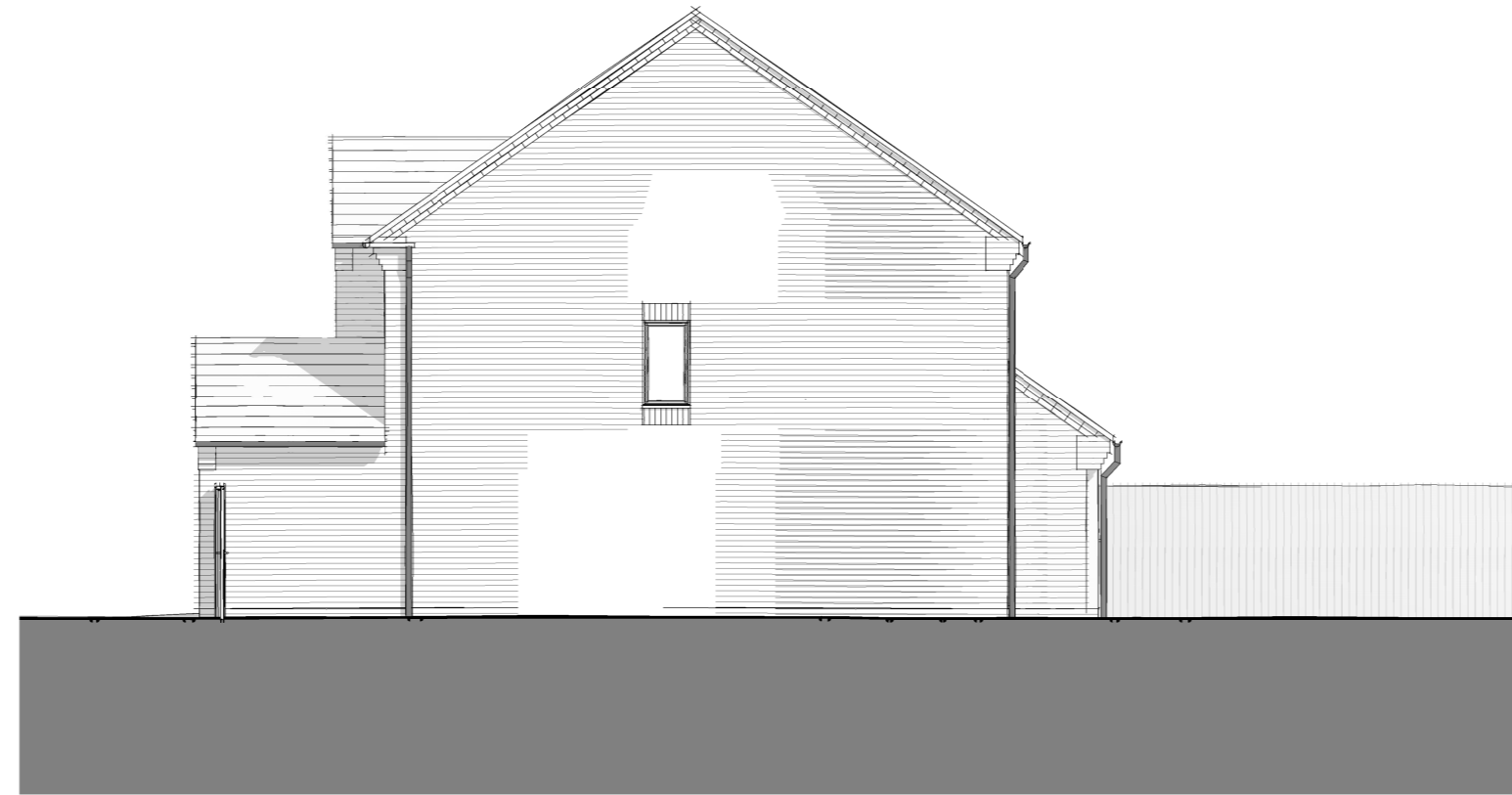
Existing Side 2 Elevation 1 : 100