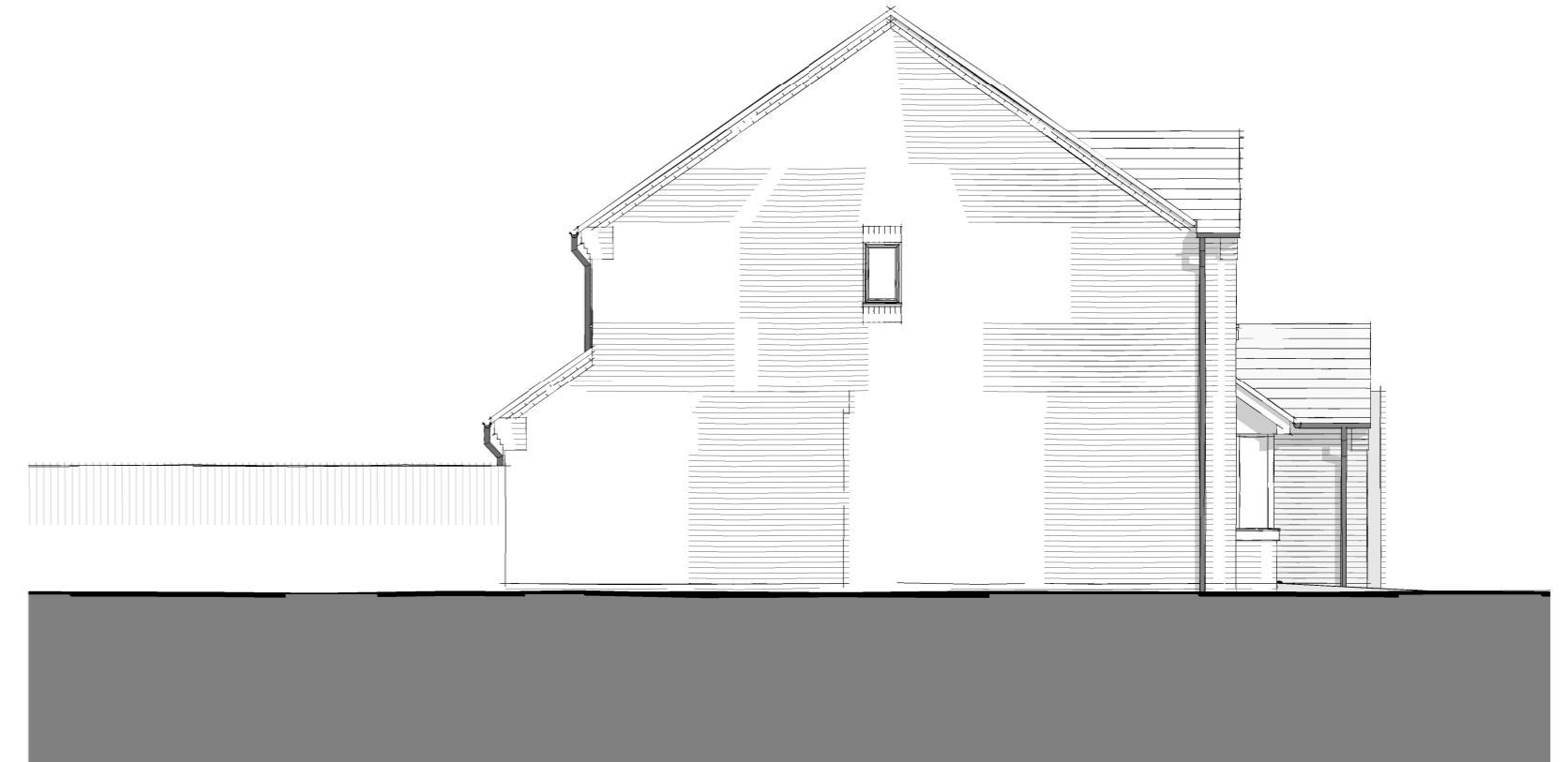
Existing Side Elevation 1 : 100