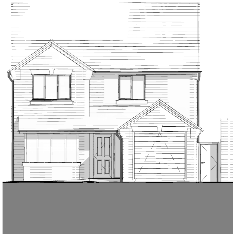
Existing Front Elevation 1 : 100