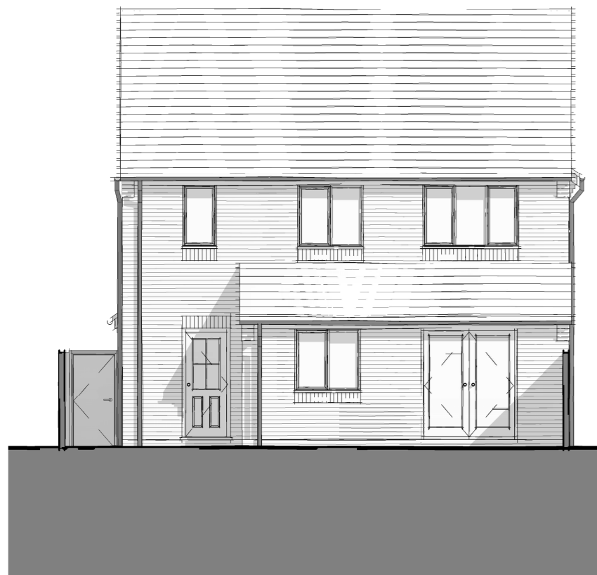
Existing Rear Elevation 1 : 100