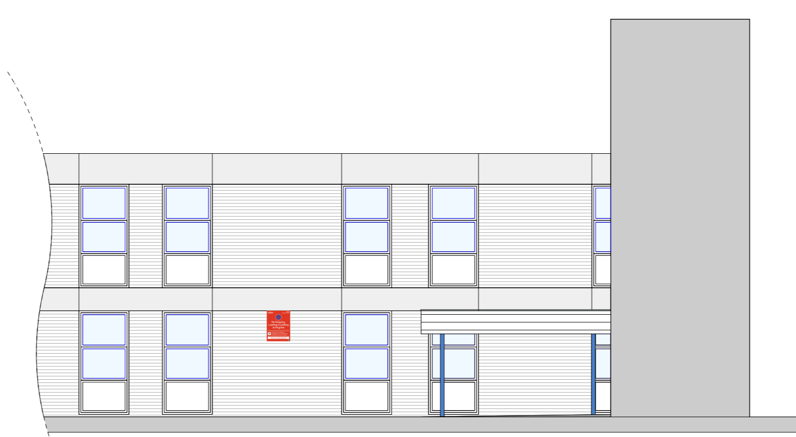
Elevation A - (East Facing) @ 1:100