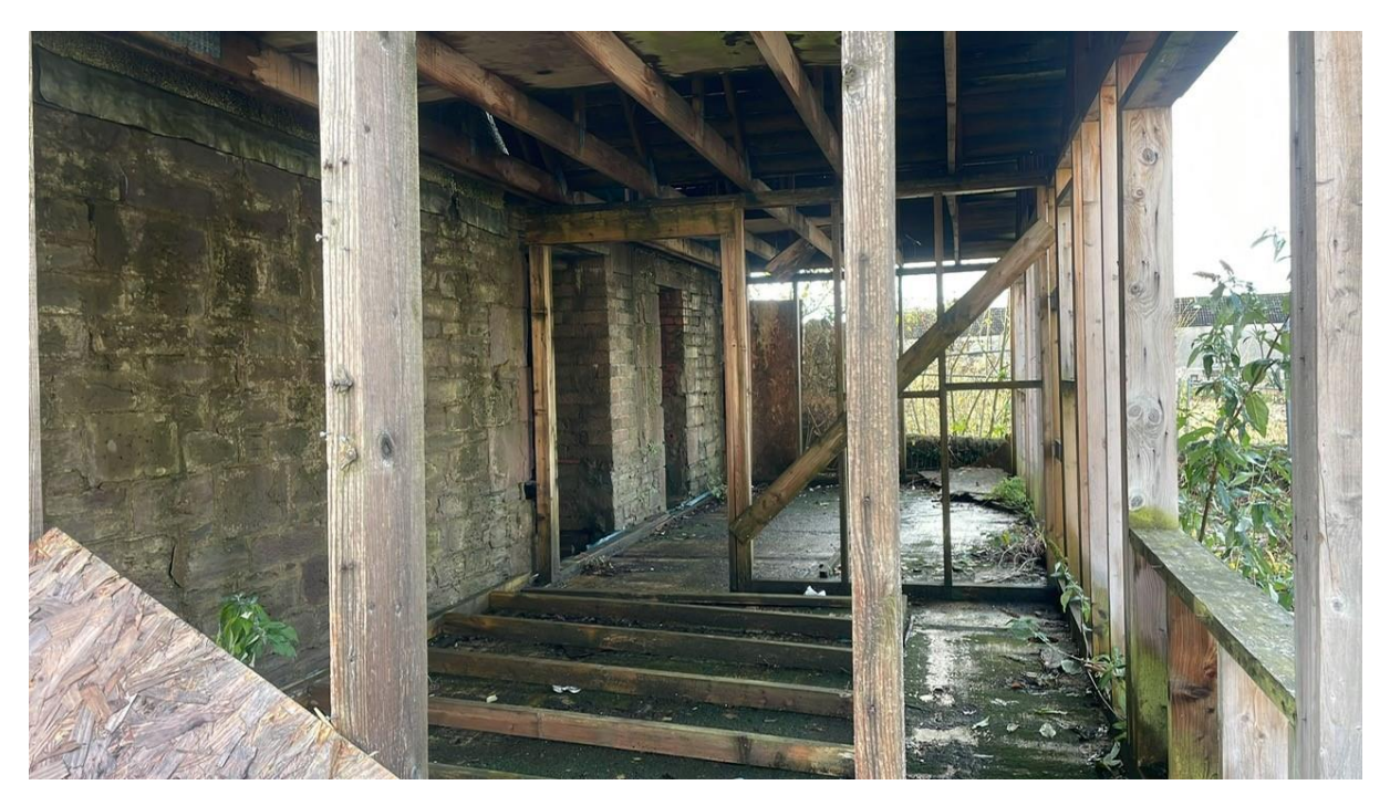
Bell Place Cottage – Modern Timber Kit Extension (Internal)