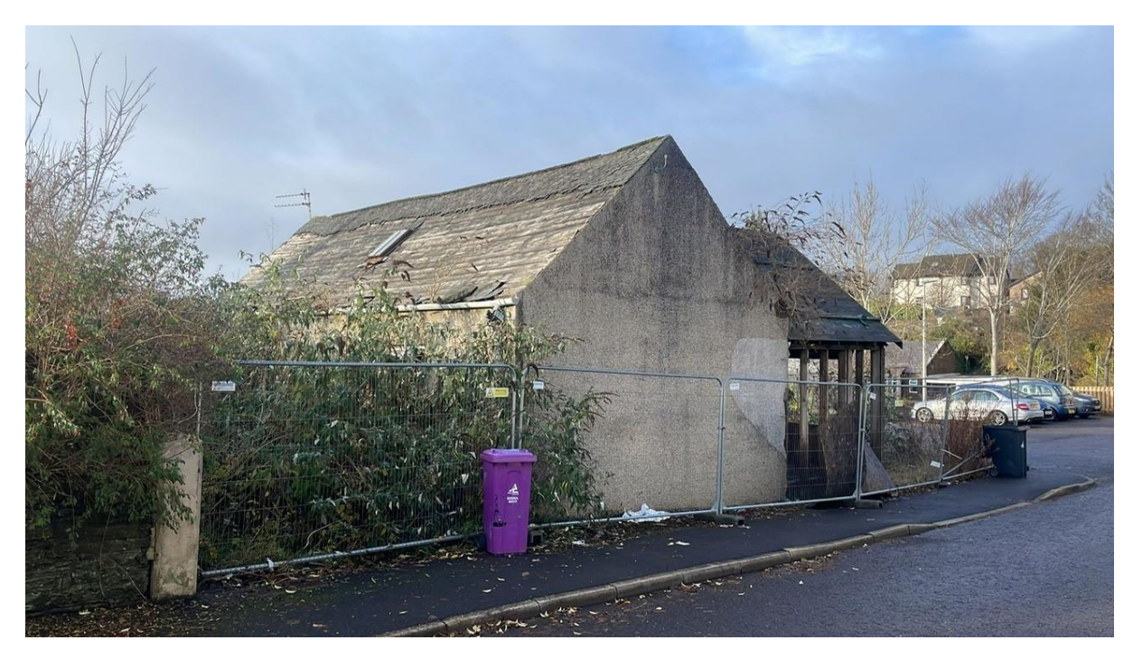
Bell Place Cottage - Side Elevation