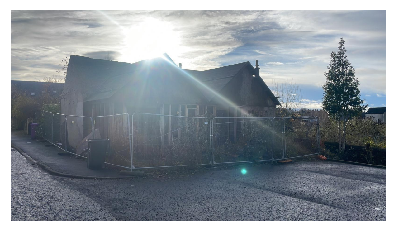
Bell Place Cottage – Frontage