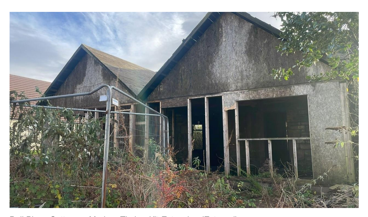
Bell Place Cottage – Modern Timber Kit Extension (External)