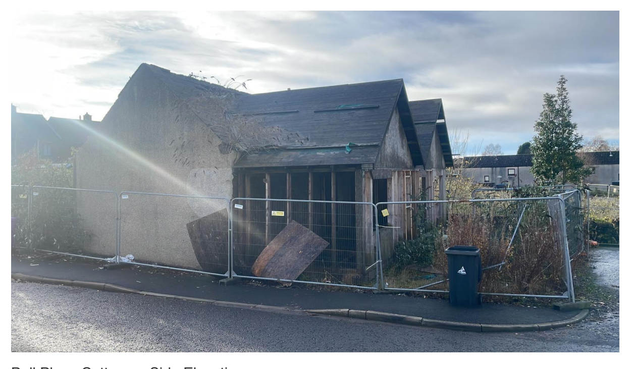
Bell Place Cottage – Side Elevation