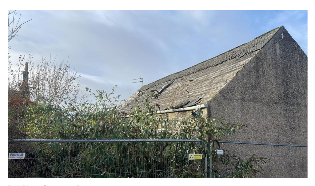
Bell Place Cottage - Rear