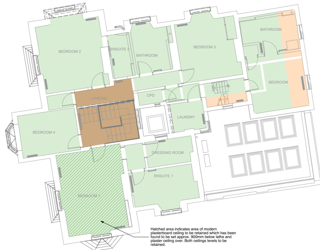
1. First Floor 1:150