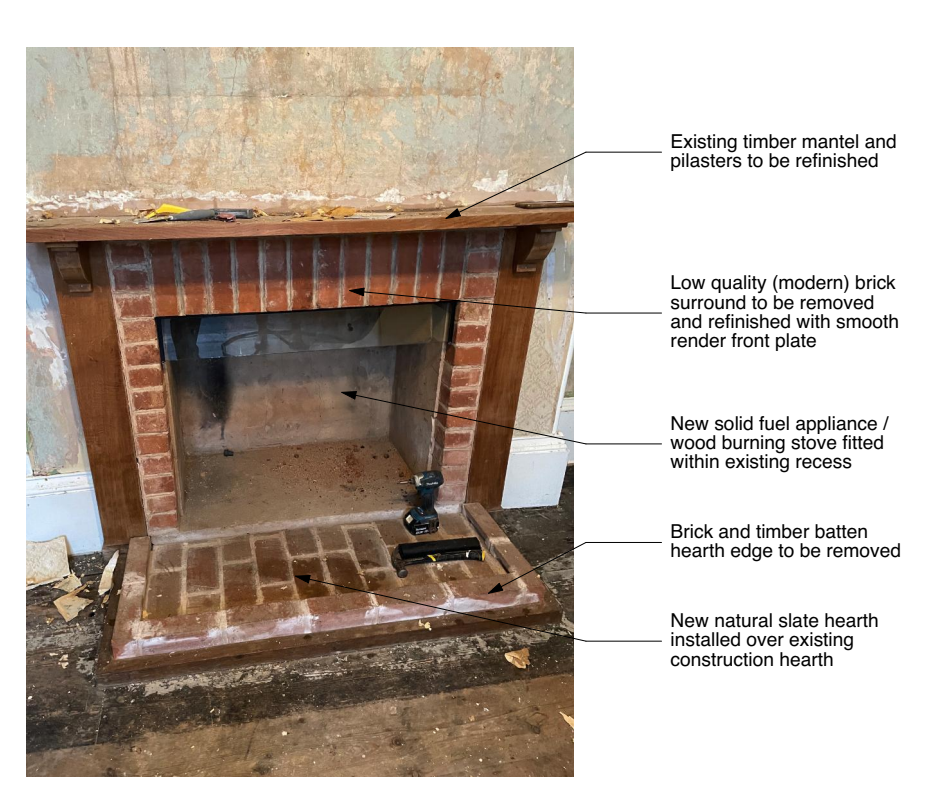
FIREPLACE 1 - LOUNGE