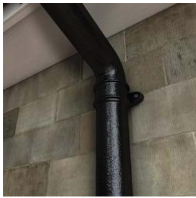
Painted cast iron half round gutters, hoppers and downpipes