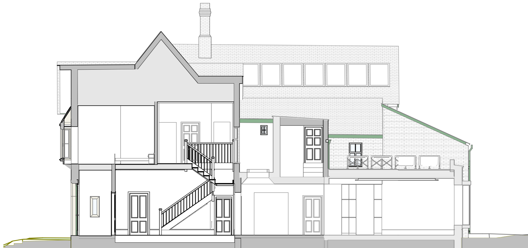
S-1 Proposed Section 1:100

Table of revisions. WIP denotes 'work in progress'