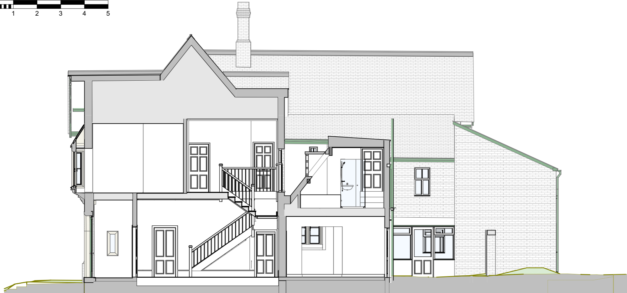
S-1 Existing Section 1:100