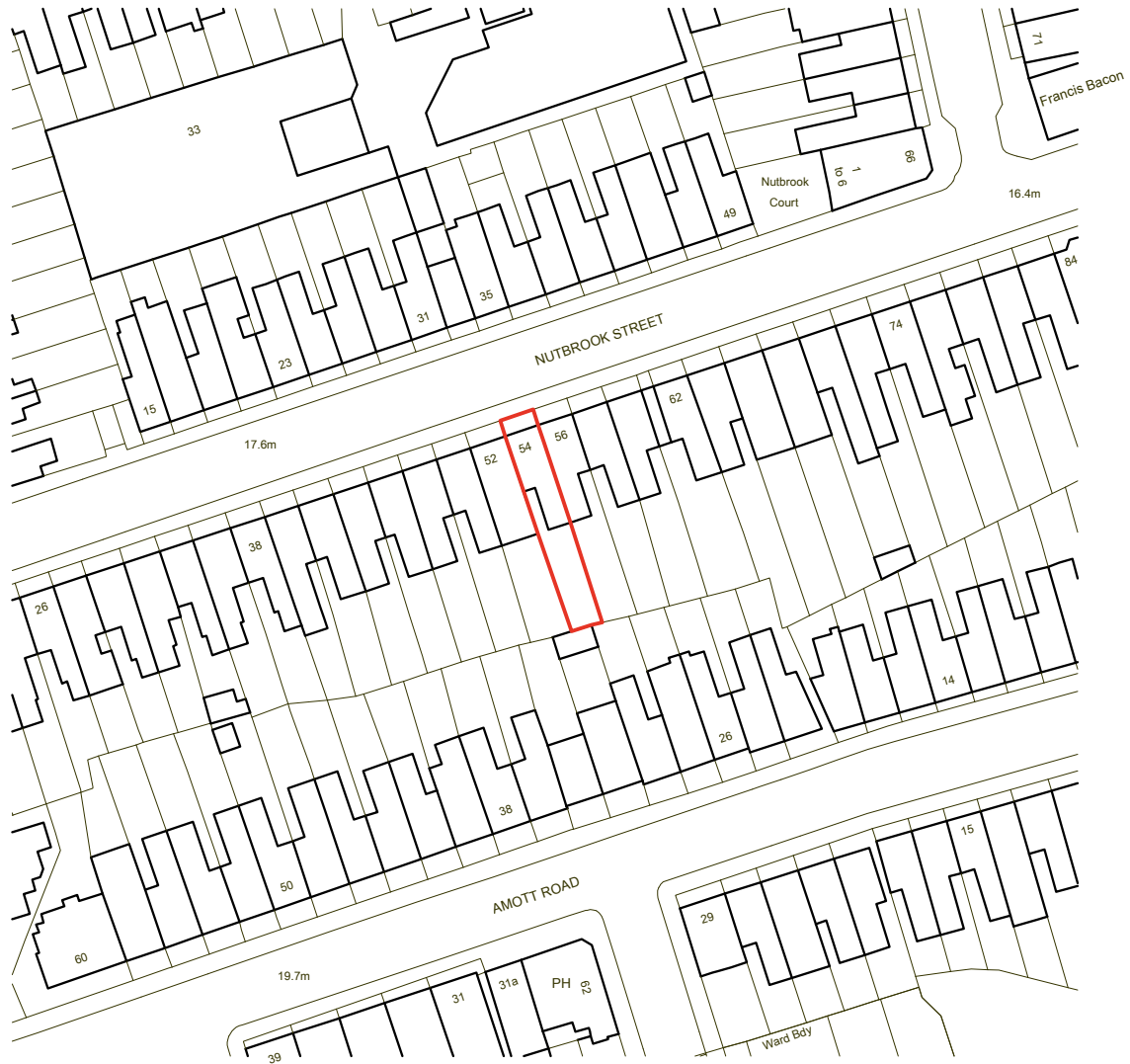
EXISTING ORDNANCE SURVEY PLAN SCALE 1:1000 @ A4