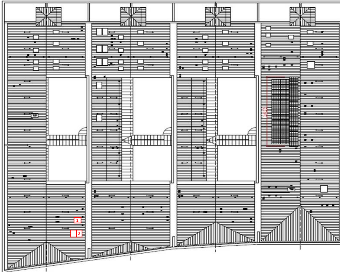
PHOTO OF PROPOSED LOCATION